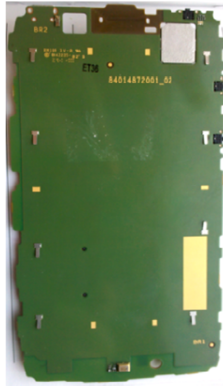
Main Board Bottom Without Shields