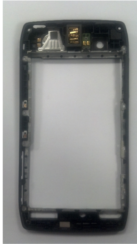
INSIDE BACK HOUSING