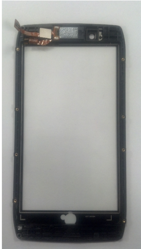
INSIDE FRONT HOUSING