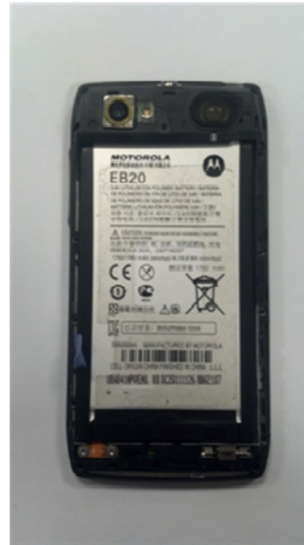
BACK OF PHONE WITH BATTERY COVER REMOVED