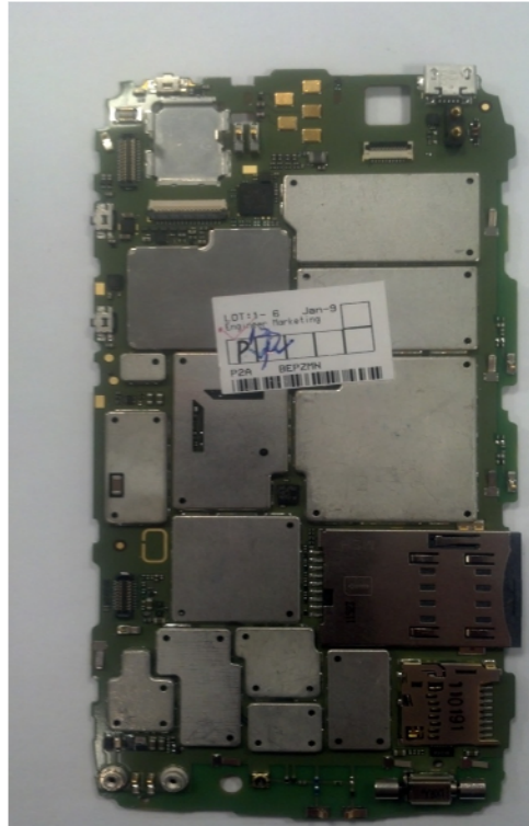
Main Board Top With Shields