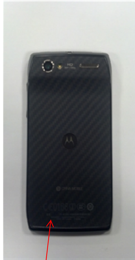
BACK OF PHONE