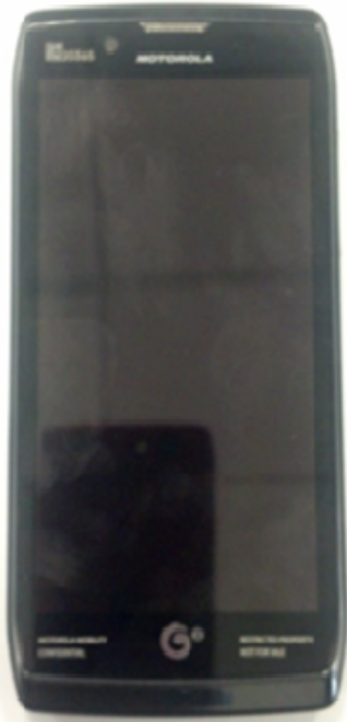
FRONT OF PHONE