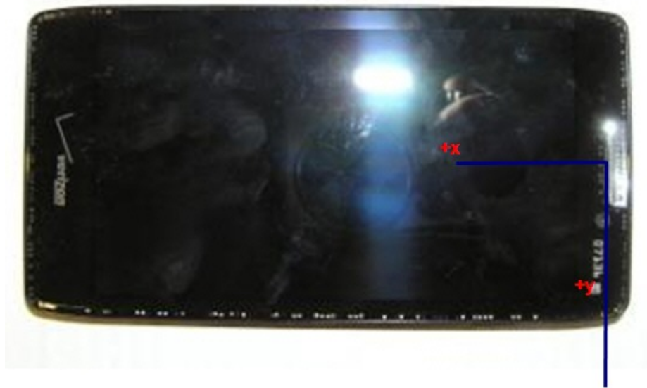
Figure 4. Coordinate Axis for T-coil Measurements