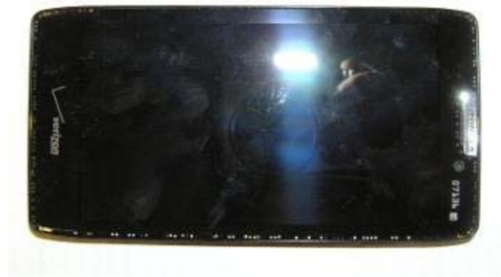
Figure 1. Phone Front