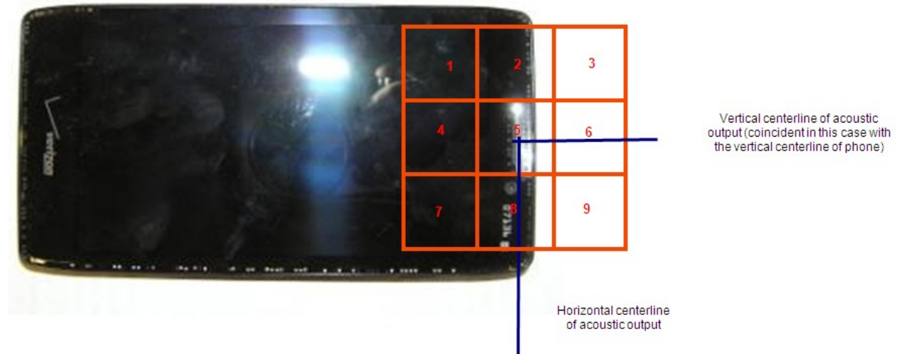
Figure 2. Phone Front - Orientation and Measurement Plane for RF Emissions Testing