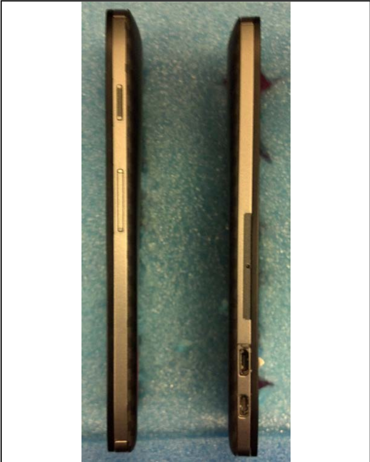
Figure 3-3. Right and Left Sides of device