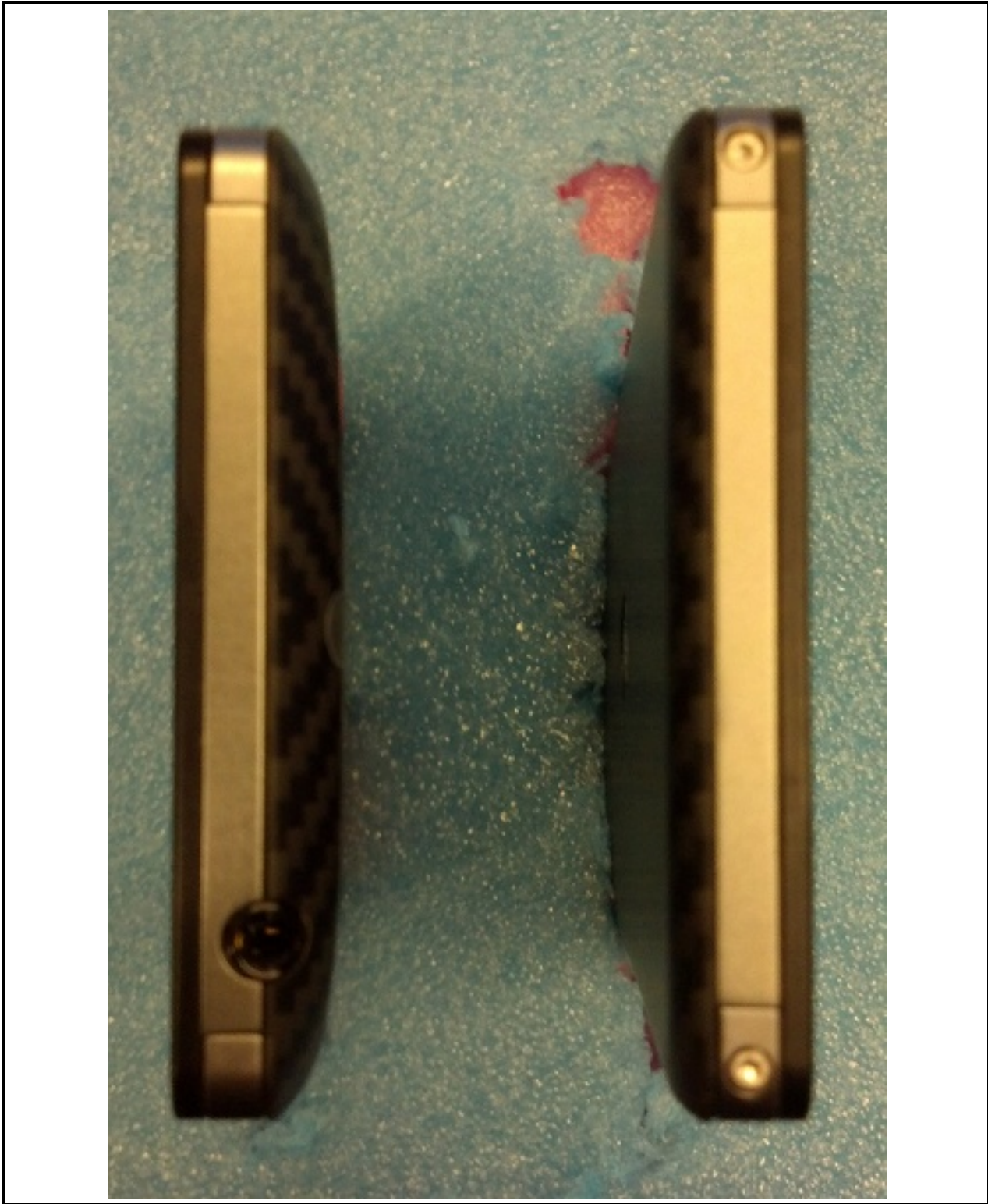
Figure 3-4. Top and Bottom Sides of Device.