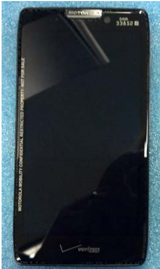
Figure 3-1. Front of device

The radio product colors, housings/bezels may vary, but only consistent with the requirements of FCC Class I Permissive Change rules and guidance (47 CFR 2.1043 and KDB 178919 D01).