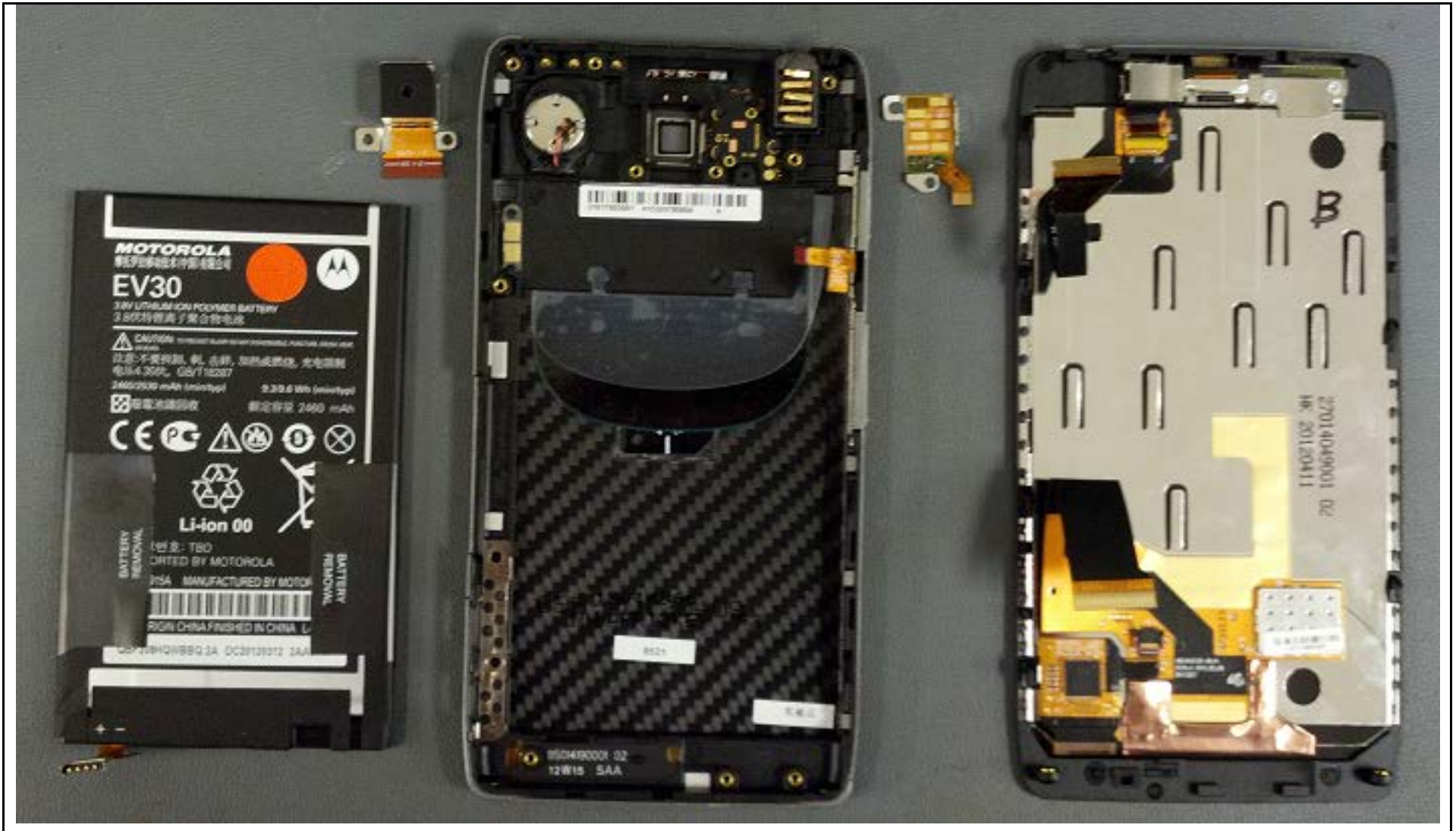
Photograph 9-1: Front and Rear Housing Interior Views, with Internal Battery.