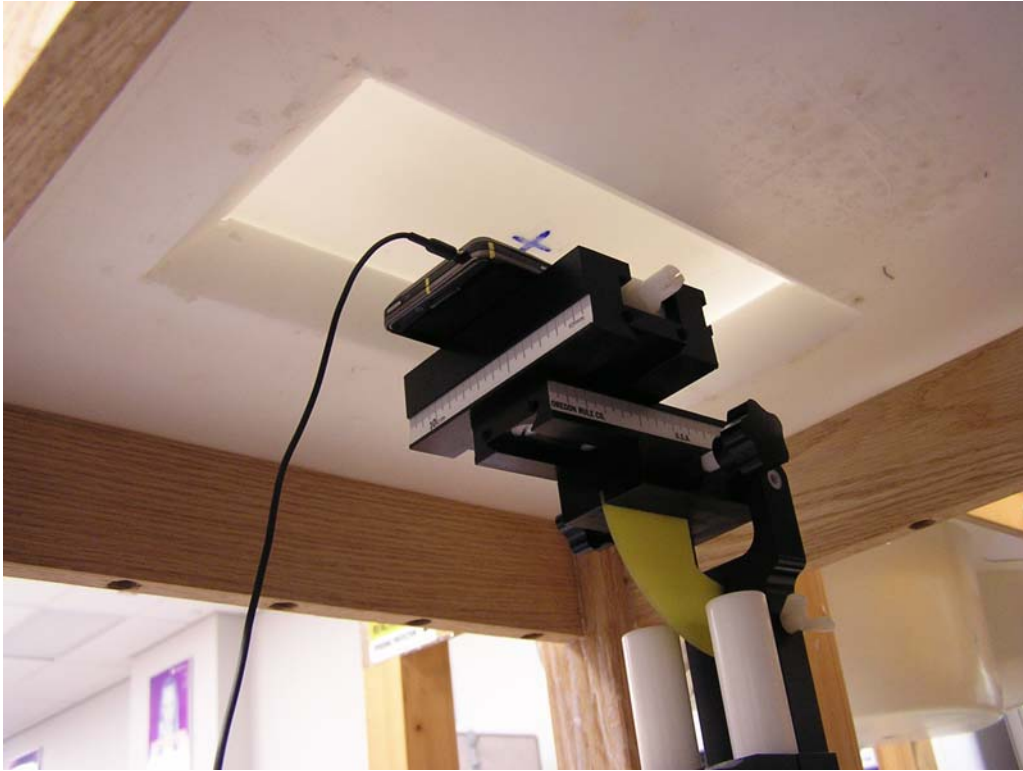
Figure 7: Body Position (25 mm separation, with audio cable shown)