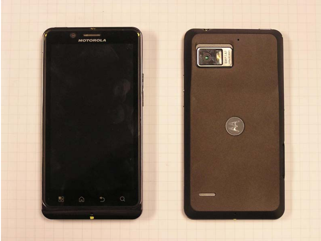
Figure 1: Phone Front and Back