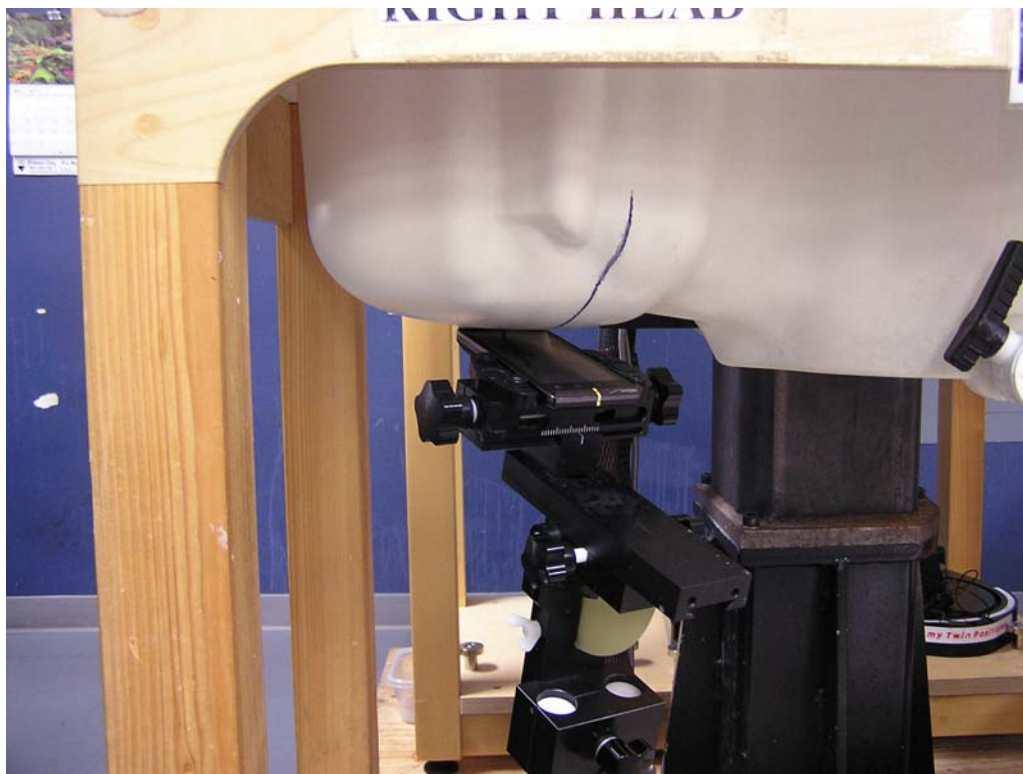
Figure 5: Tilt Position, Front of Head of Phantom