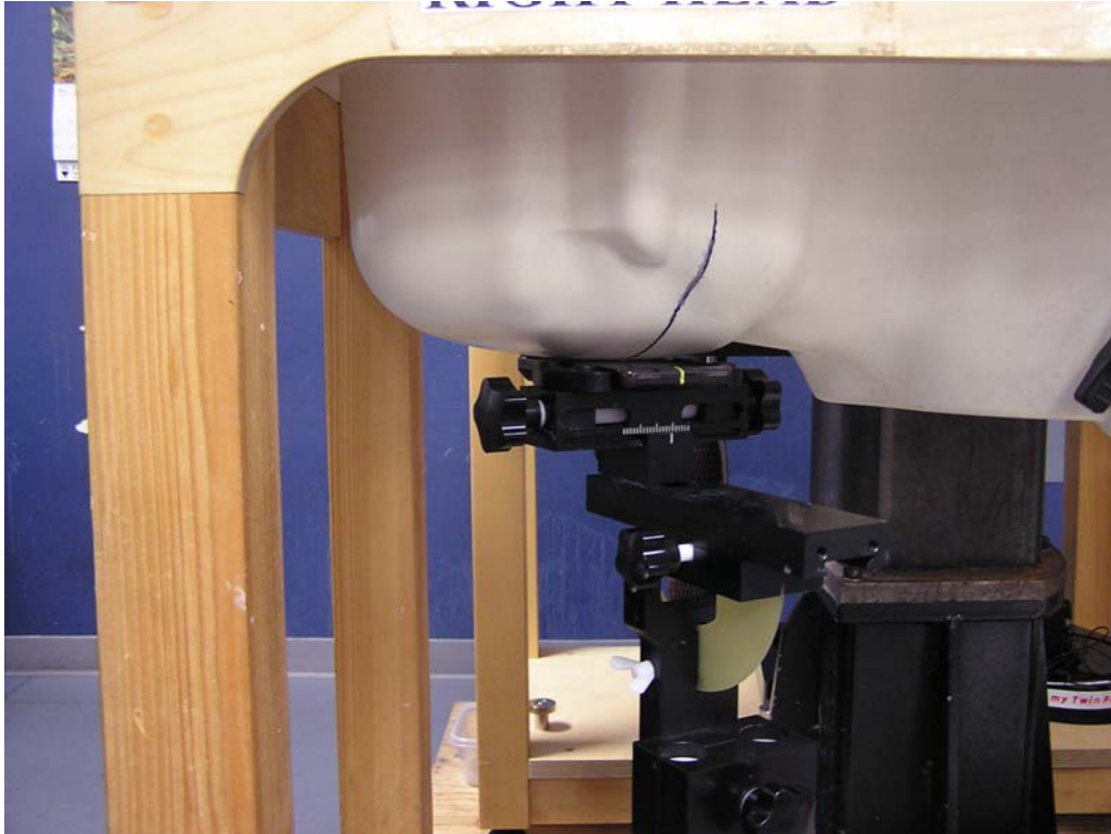
Figure 3: Cheek Position, Front of Head of Phantom