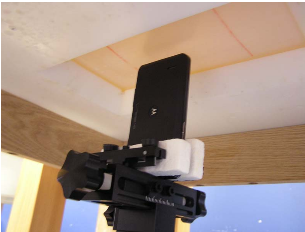
Figure 10: Mobile Hotspot Position, Bottom Edge of Phone facing Phantom (10 mm separation)