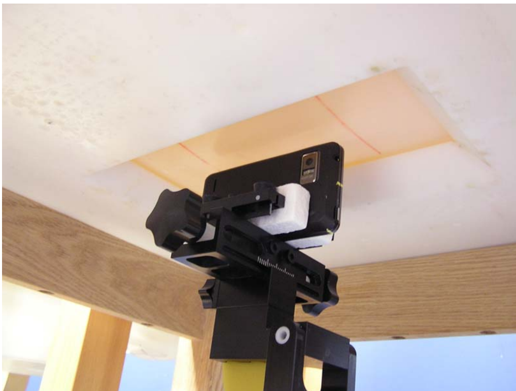
Figure 9: Mobile Hotspot Position, Right Edge of Phone facing Phantom (10 mm separation)