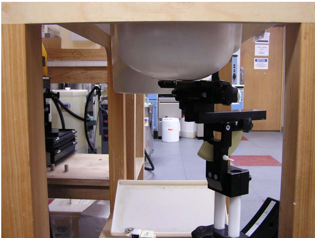
Figure 4: Cheek Position, Top of Head of Phantom