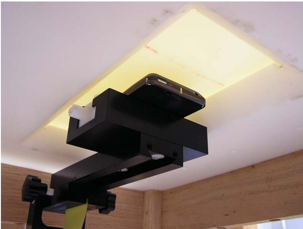
Figure 8: Mobile Hotspot Position, Back of Phone facing Phantom (10 mm separation)