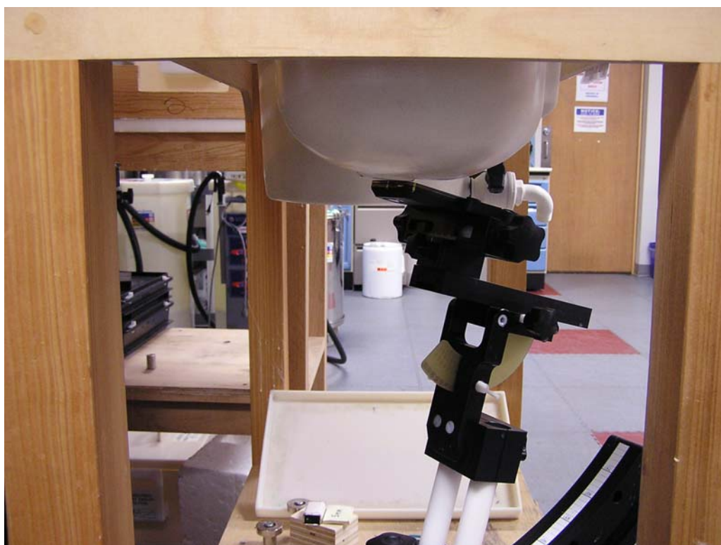
Figure 6: Tilt Position, Top of Head of Phantom