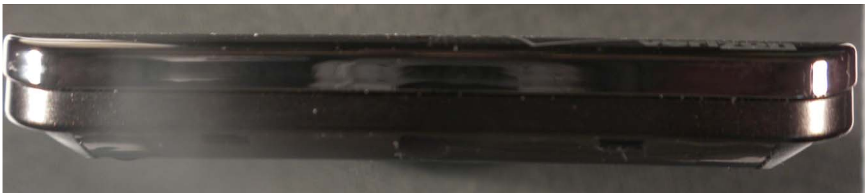
BOTTOM OF PHONE