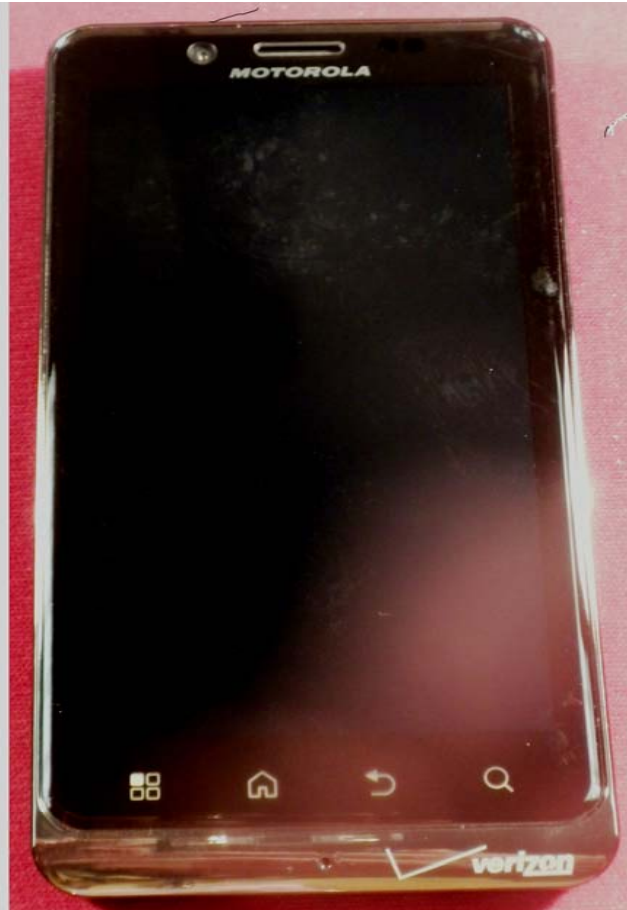
FRONT OF PHONE