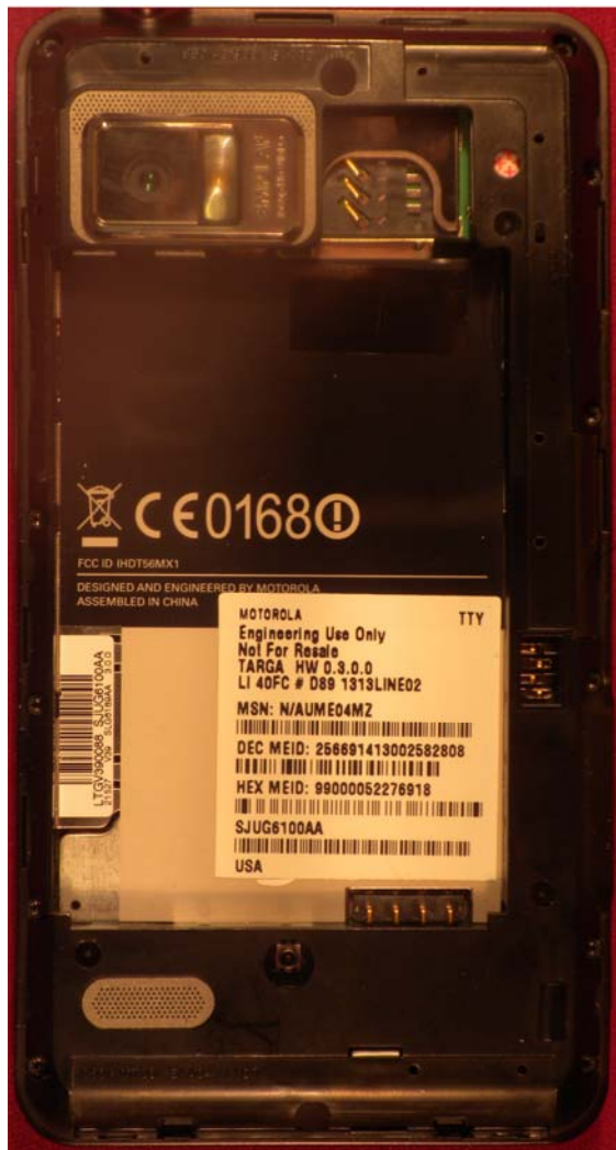
BACK OF PHONE WITH BATTERY COVER REMOVED