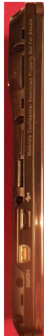
SIDES OF PHONE