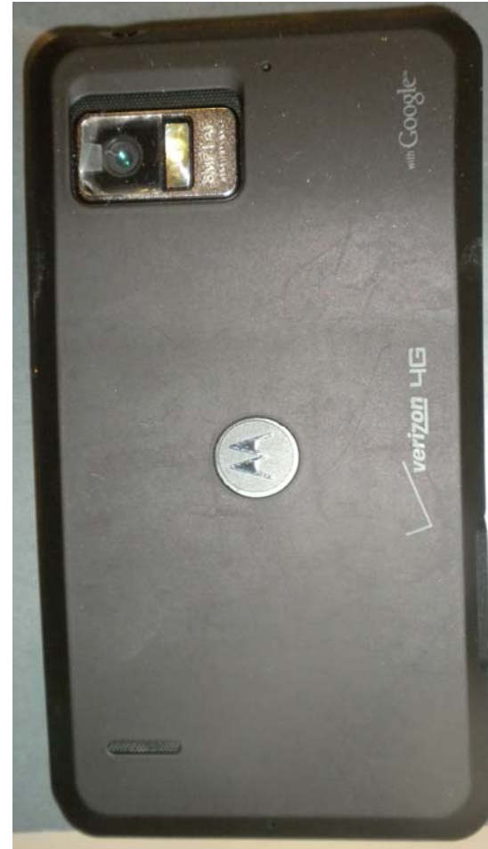
BACK OF PHONE