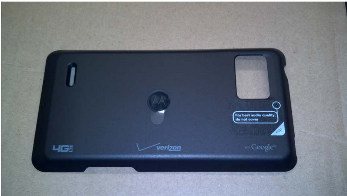
INDUCTIVE BATTERY CHARGING DOOR