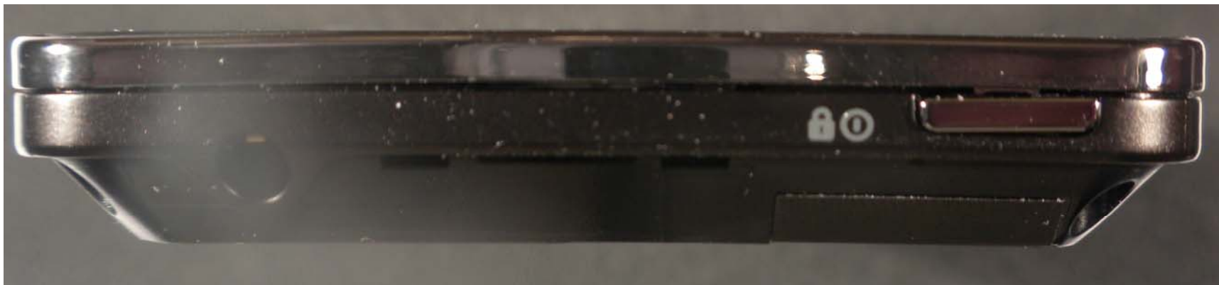
TOP OF PHONE