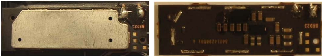
PC BOARD (COMPONENT SIDE, WITH AND WITHOUT SHIELDS)