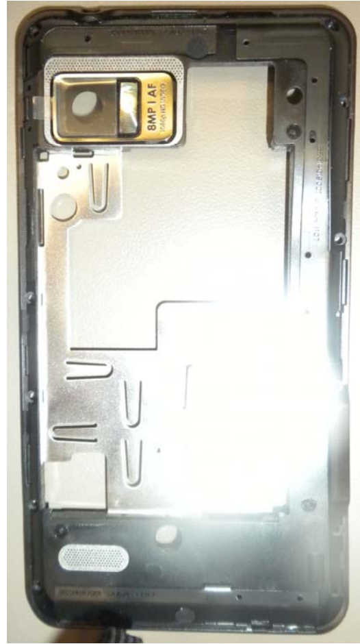
Outside view of back housing