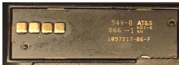
PC BOARD (CONTACT SIDE)