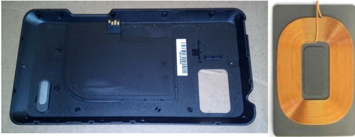
INDUCTIVE BATTERY CHARGING DOOR, AND EMBEDDED PICK-UP COIL