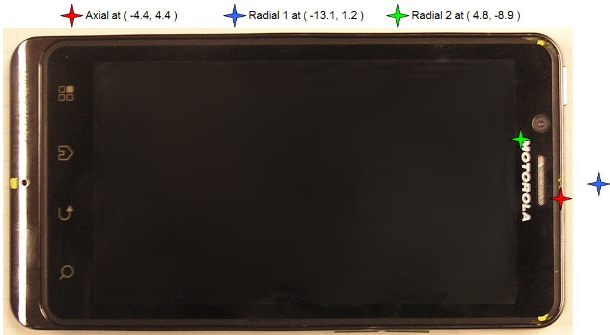
Figure 6. Location of point measurements for ABM (Telecoil) Emissions with inductive charging door SJHN0401A