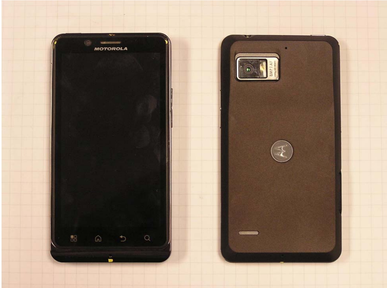
Figure 1. Phone Front and Back