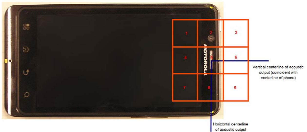
Figure 2. Phone Front - Orientation and Measurement Plane for RF Emissions Testing