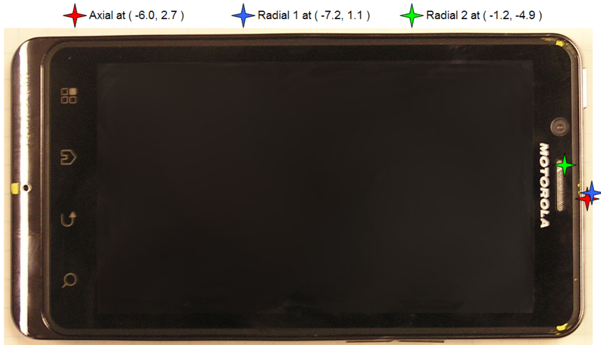
Figure 5. Location of point measurements for ABM (Telecoil) Emissions