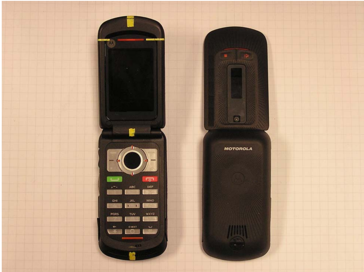
Figure 1. Phone Open (Front / Back)