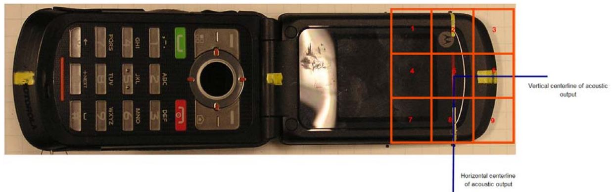
Figure 2. Phone Open - Orientation and Measurement Plane for RF Emissions Testing