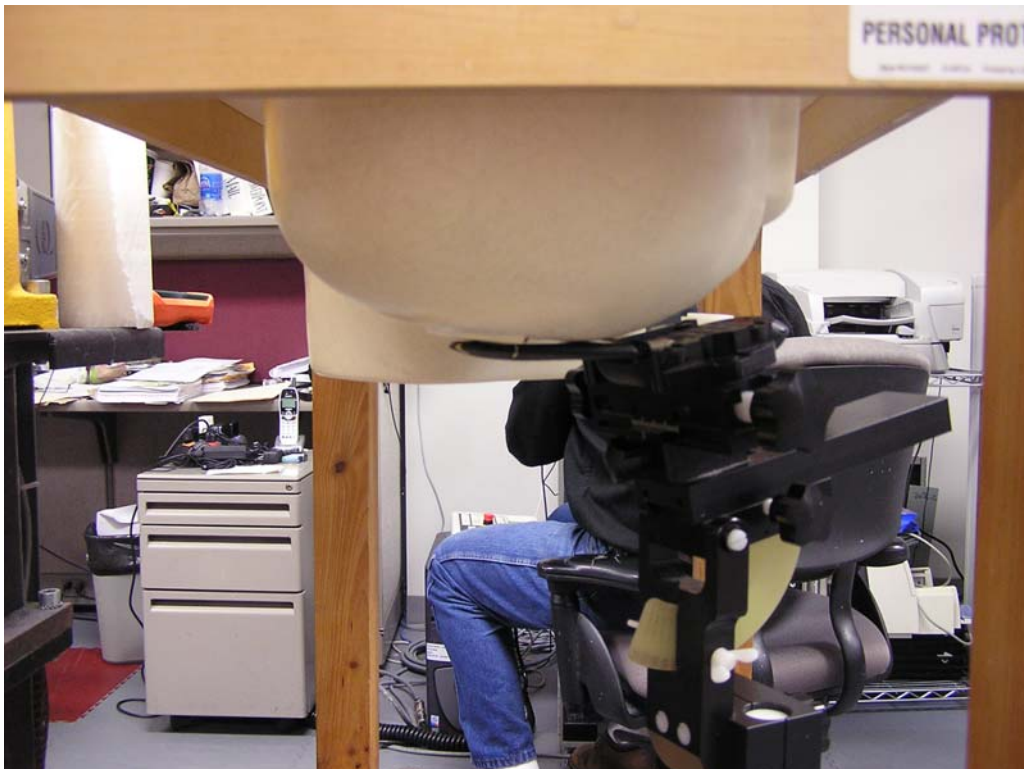
Figure 6: Cheek Position, Top of Head of Phantom