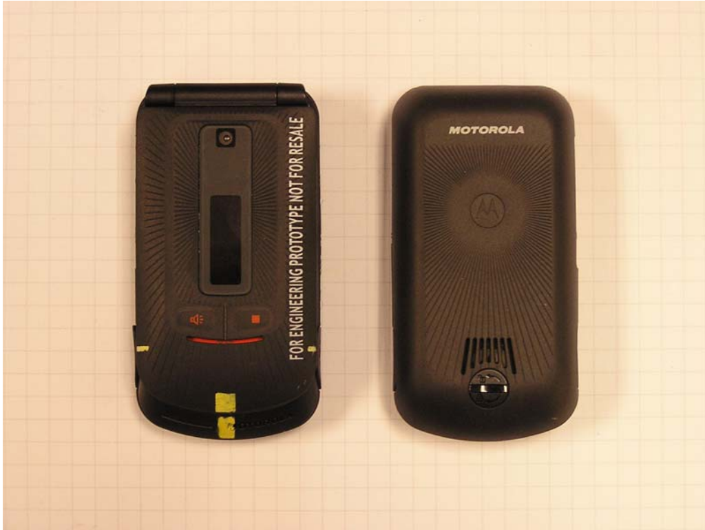
Figure 1: Phone Front and Back, Flip closed