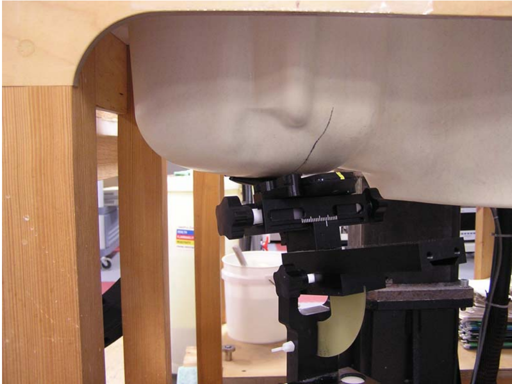
Figure 5: Cheek Position, Front of Head of Phantom