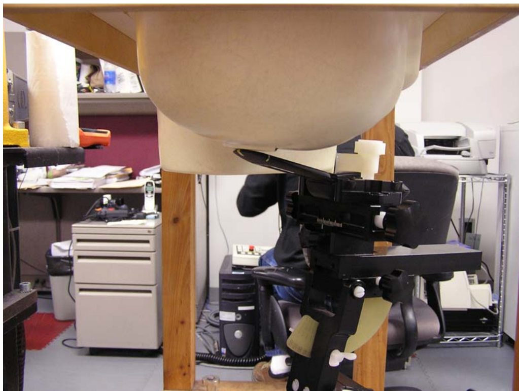
Figure 8: Tilt Position, Top of Head of Phantom