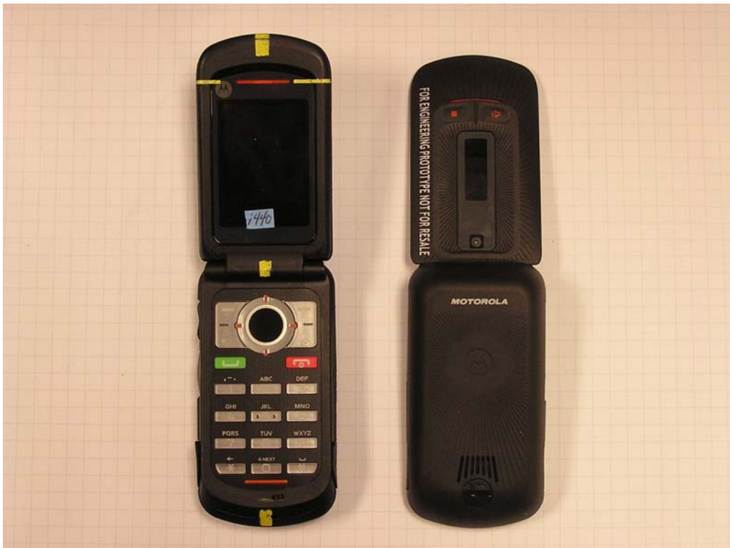
Figure 2: Phone Front and Back, Flip open