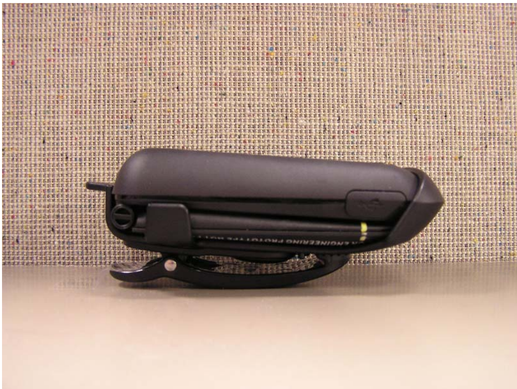
Figure 4: Phone with Holster