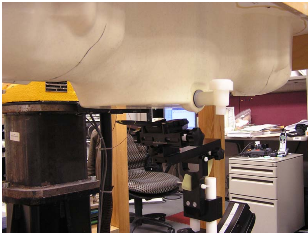
Figure 9: Dispatch/Push-to-Talk Position, Flip Open