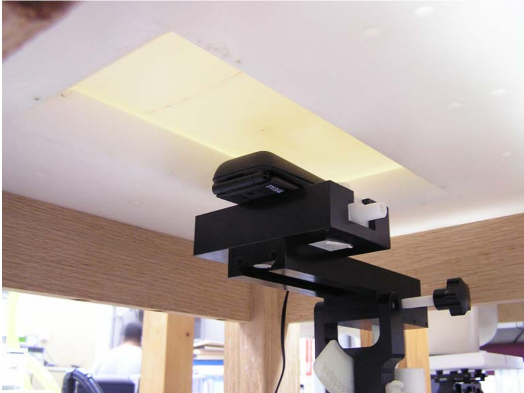
Figure 11: Body Position