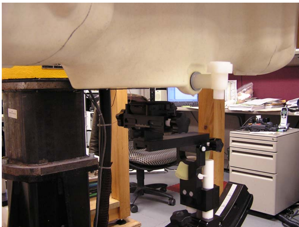
Figure 10: Dispatch/Push-to-Talk Position, Flip Closed