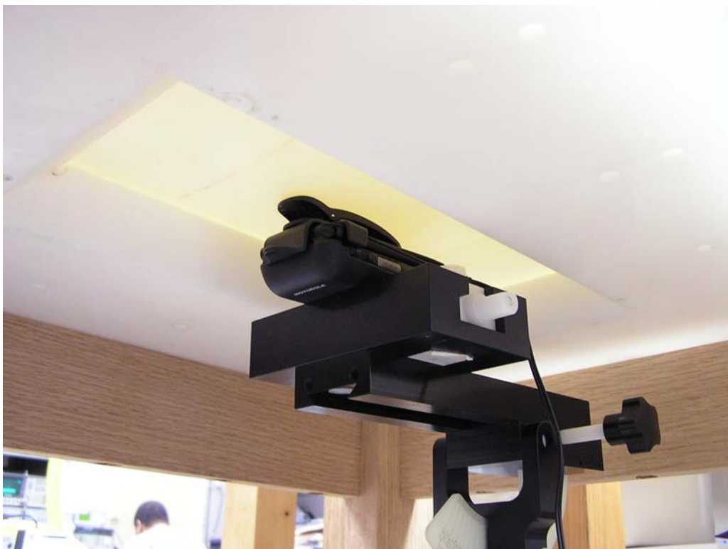
Figure 12: Body Position with Holster