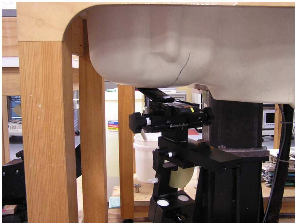
Figure 7: Tilt Position, Front of Head of Phantom