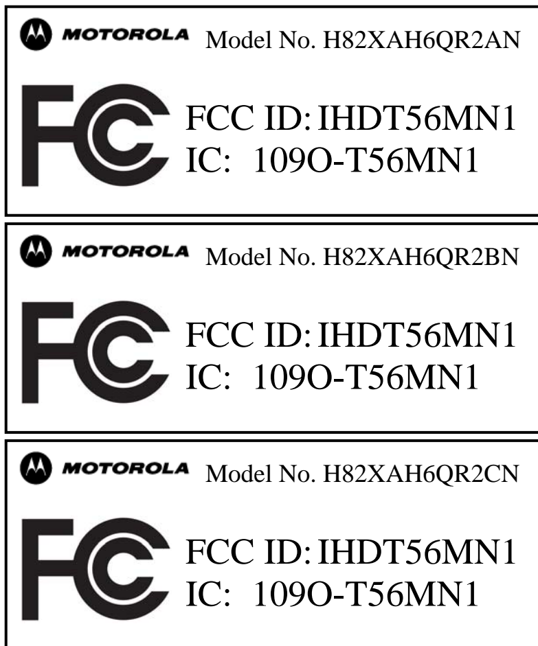
Figure 1.3.1. Representation of FCC Label information.

The FCC label shown is representative of the label that will appear on the radio when in production.