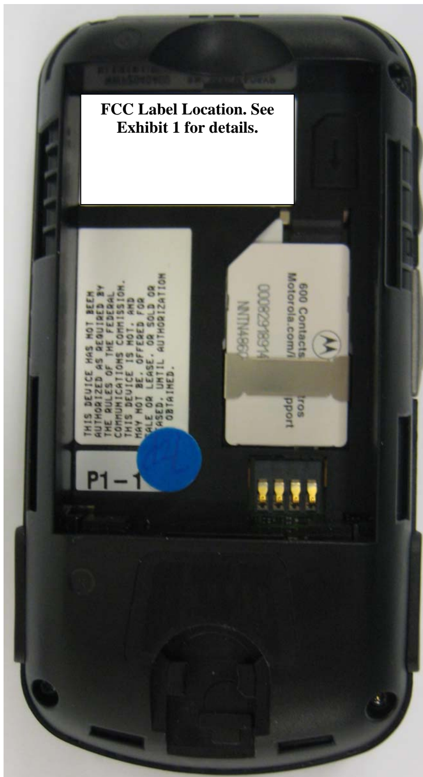
Figure 3-7. Interior Compartment of radio