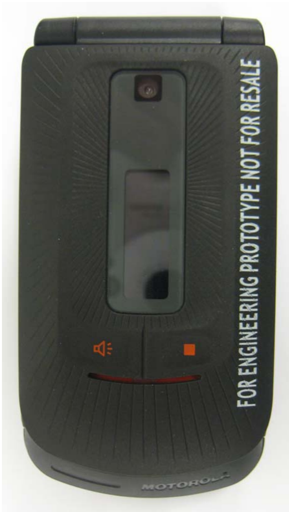
Figure 3-3. Front of radio (Closed)