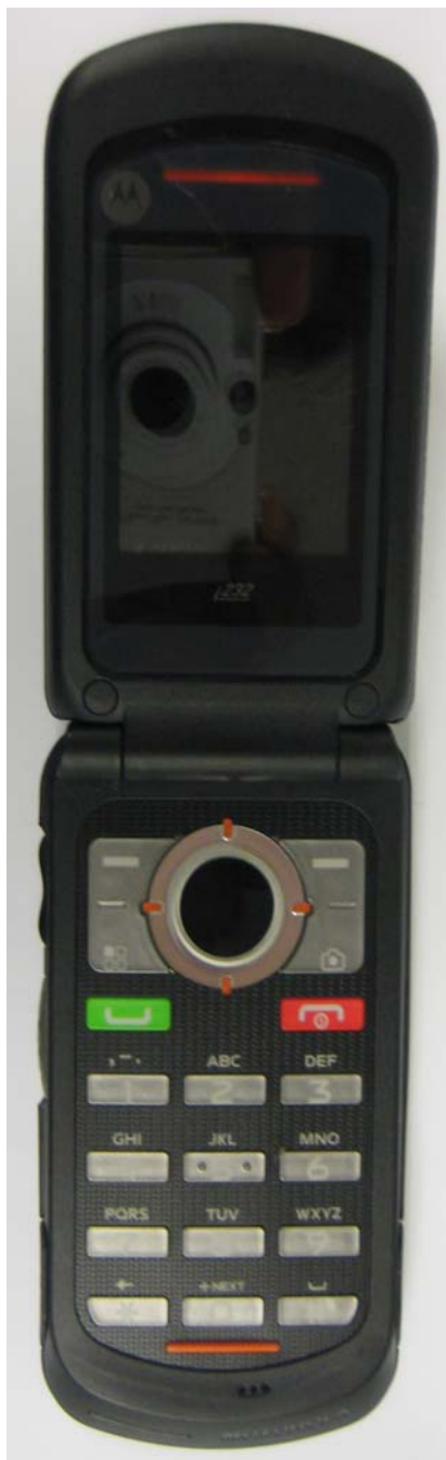
Figure 3-1. Front of radio

The radio product shapes, colors and housings/bezels may vary.