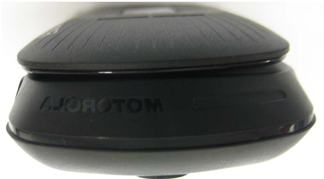
Figure 3-6. Bottom of radio