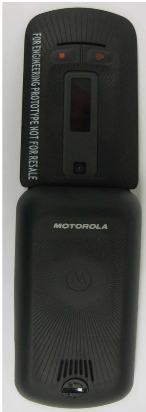
Figure 3-2. Back of radio