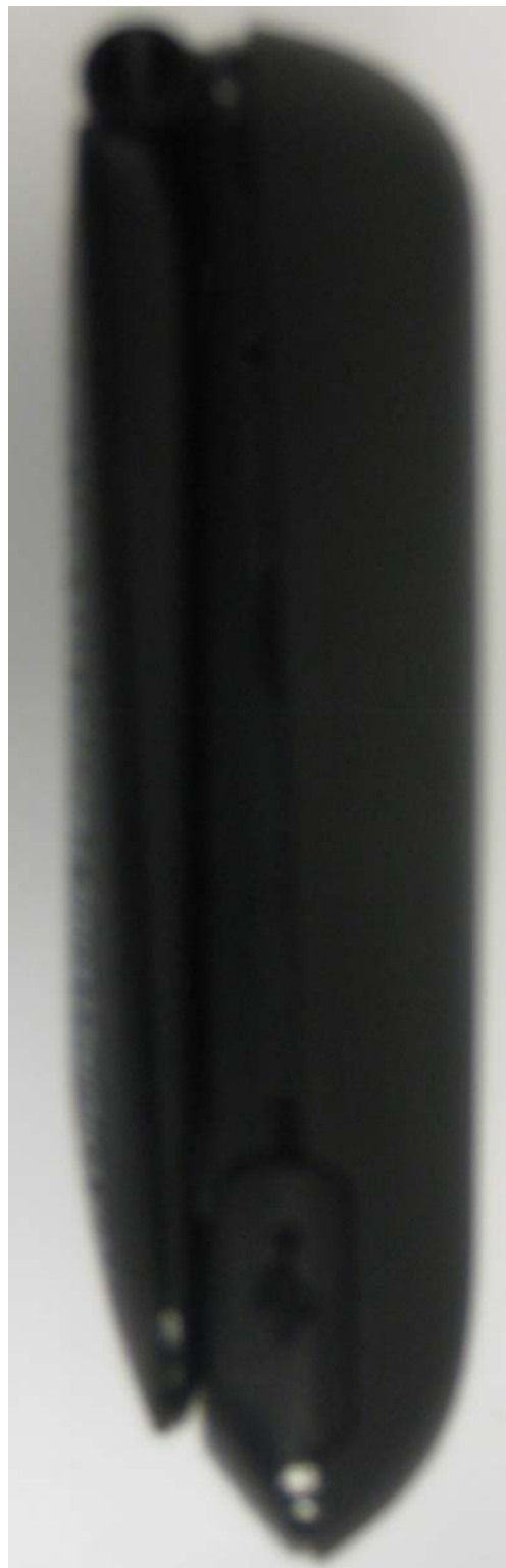
Figure 3-4. Opposite Side of radio