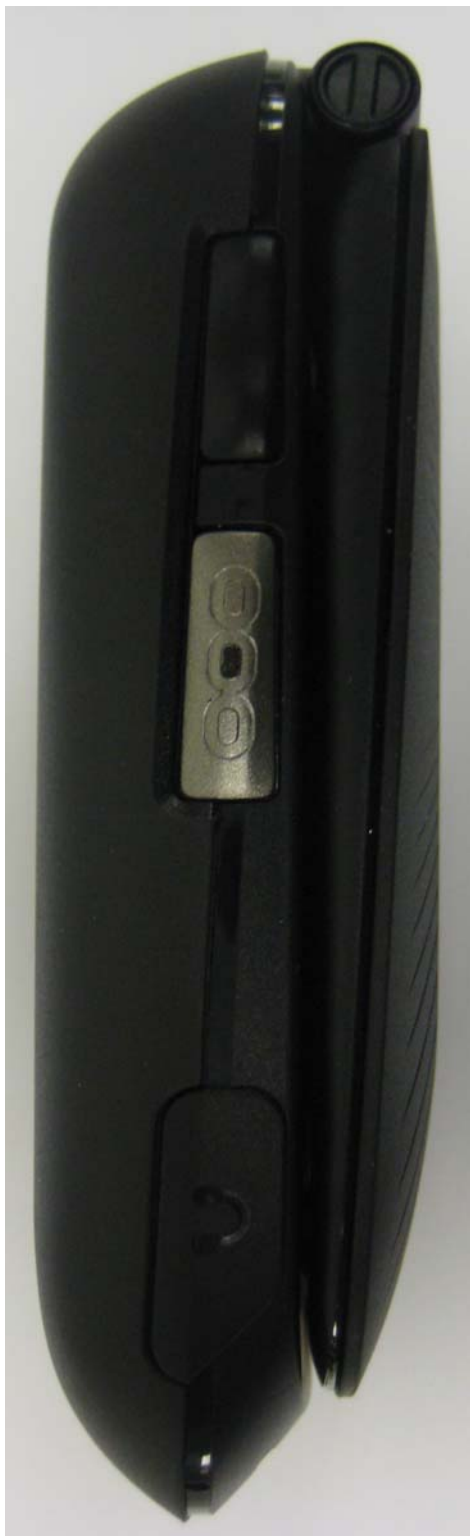
Figure 3-3. Button Side of radio