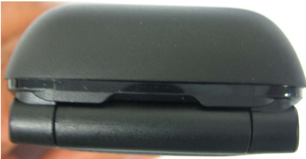
Figure 3-5. Top of radio