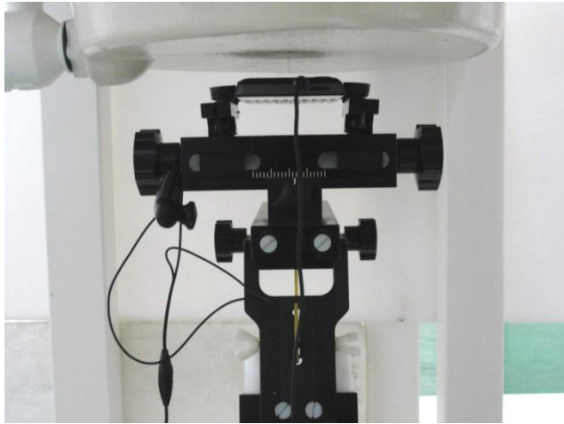
Bottom of the DUT with Phantom 1.5 cm Gap