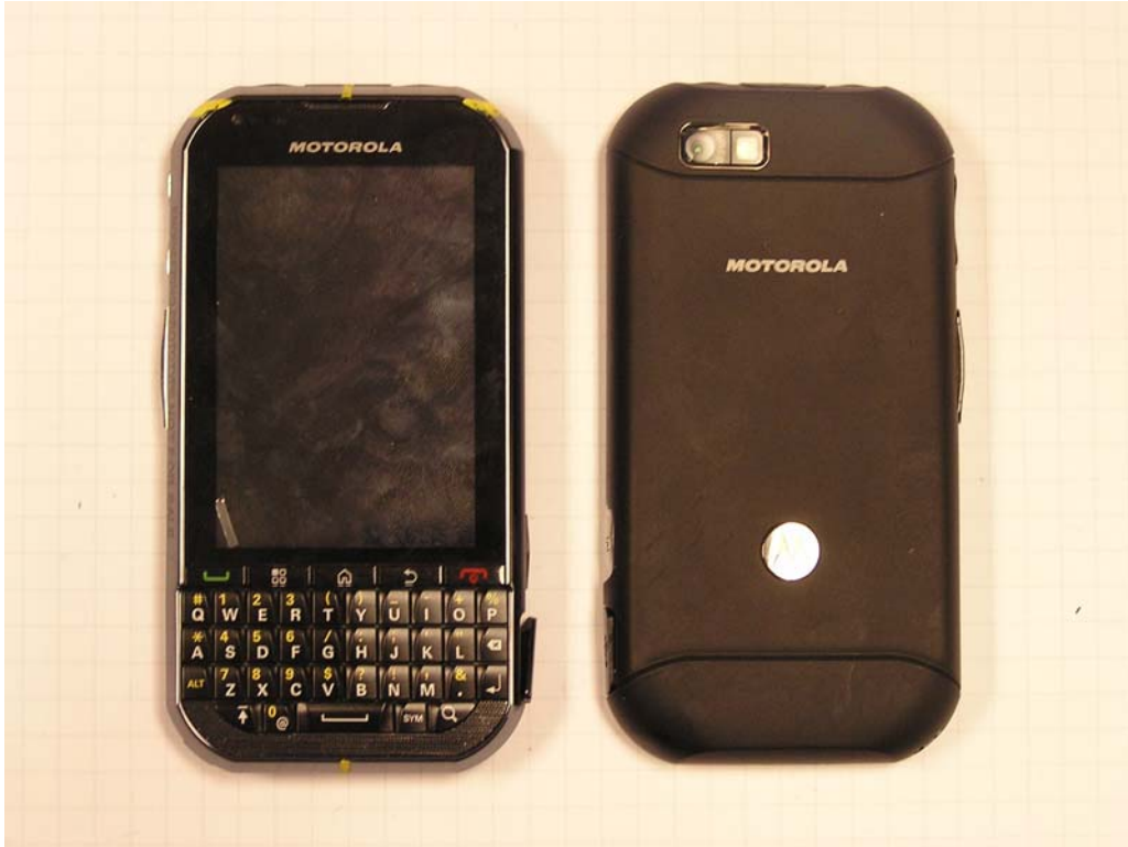
Figure 1: Phone Front and Back, Flip closed