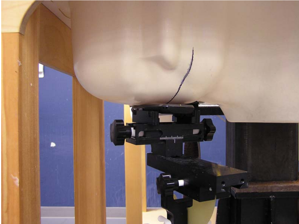
Figure 3: Cheek Position, Front of Head of Phantom