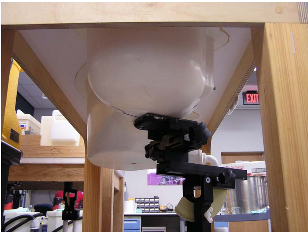
Figure 4: Cheek Position, Top of Head of Phantom