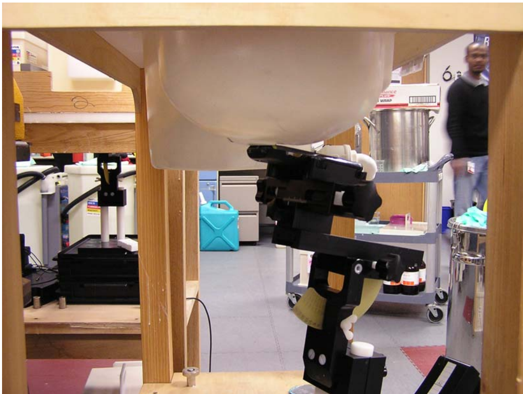
Figure 6: Tilt Position, Top of Head of Phantom