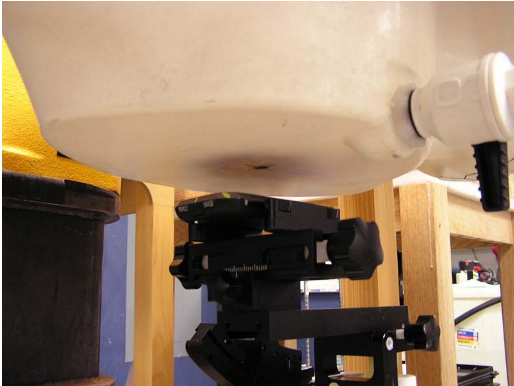
Figure 7: Dispatch/Push-to-Talk Position