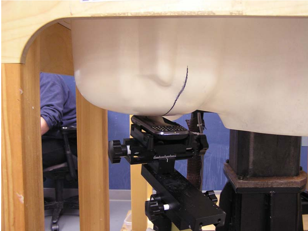
Figure 5: Tilt Position, Front of Head of Phantom