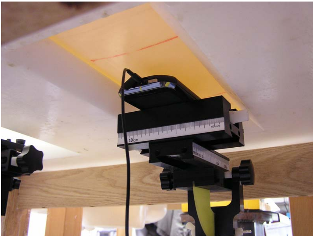
Figure 8: Body Position