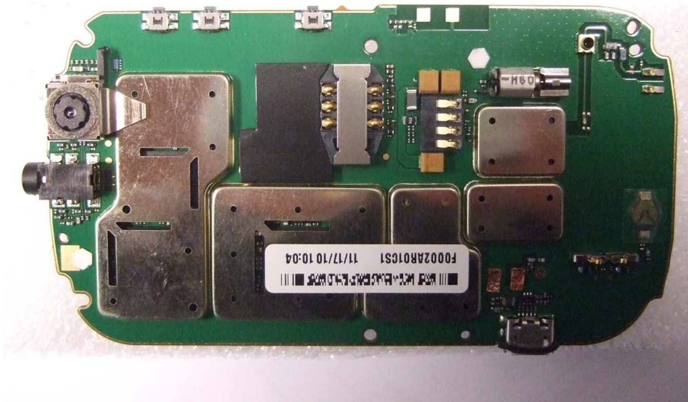
Photograph 9-1: Component side view of radio product PC Board.