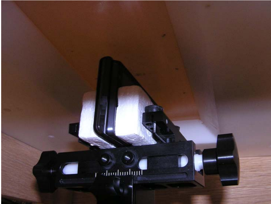
Figure 8: Mobile Hotspot Position at 10mm away from phantom Long edge of phone (right or left)