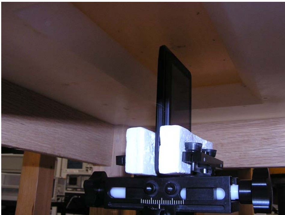
Figure 9: Mobile Hotspot Position at 10mm away from phantom Short edge of phone (top or bottom)