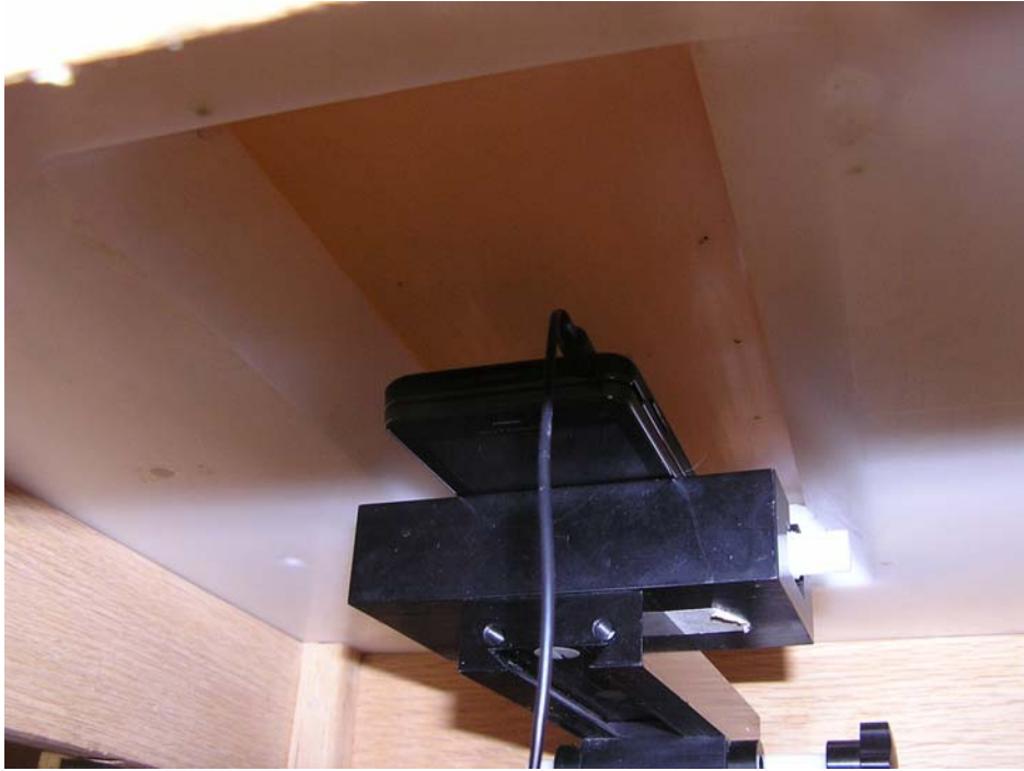
Figure 6: Body Position at 25mm away from phantom (back of phone)