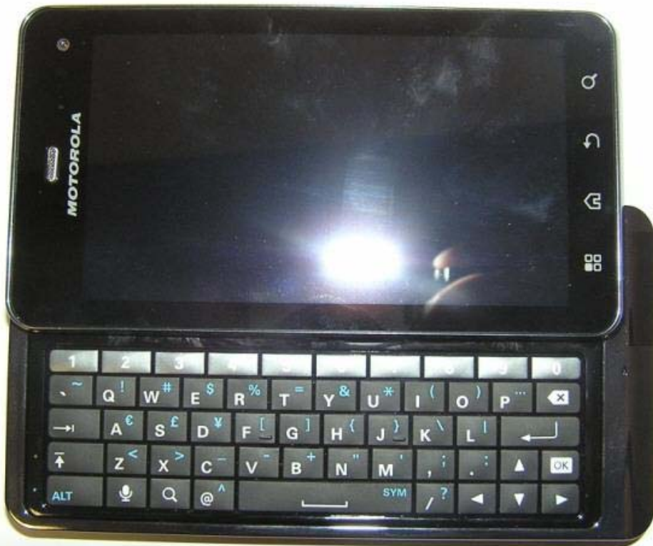
Figure 2. Phone Open