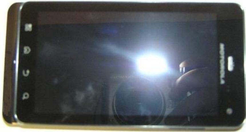
Figure 1. Phone Closed