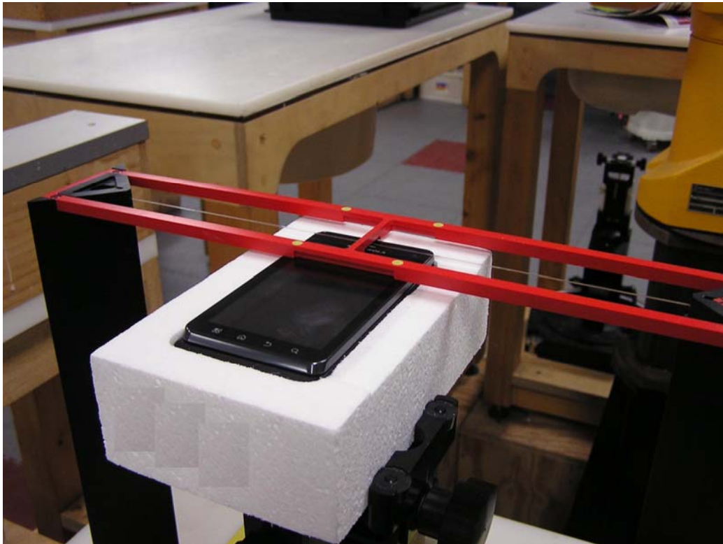
Figure 4. Positioning and Measurement for RF Emissions