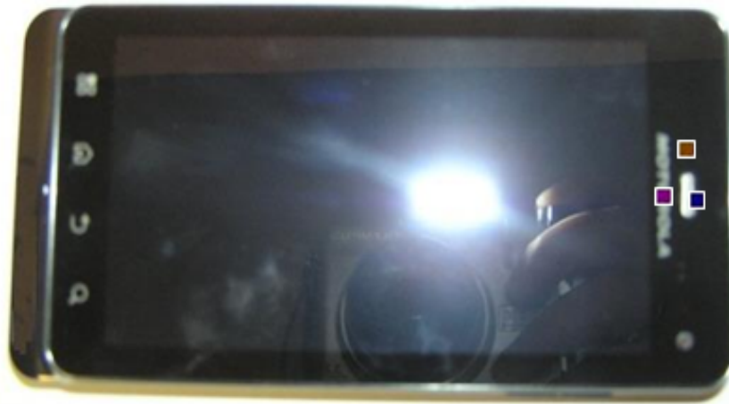
Figure 6. Location of Measured Points for T-coil measurements