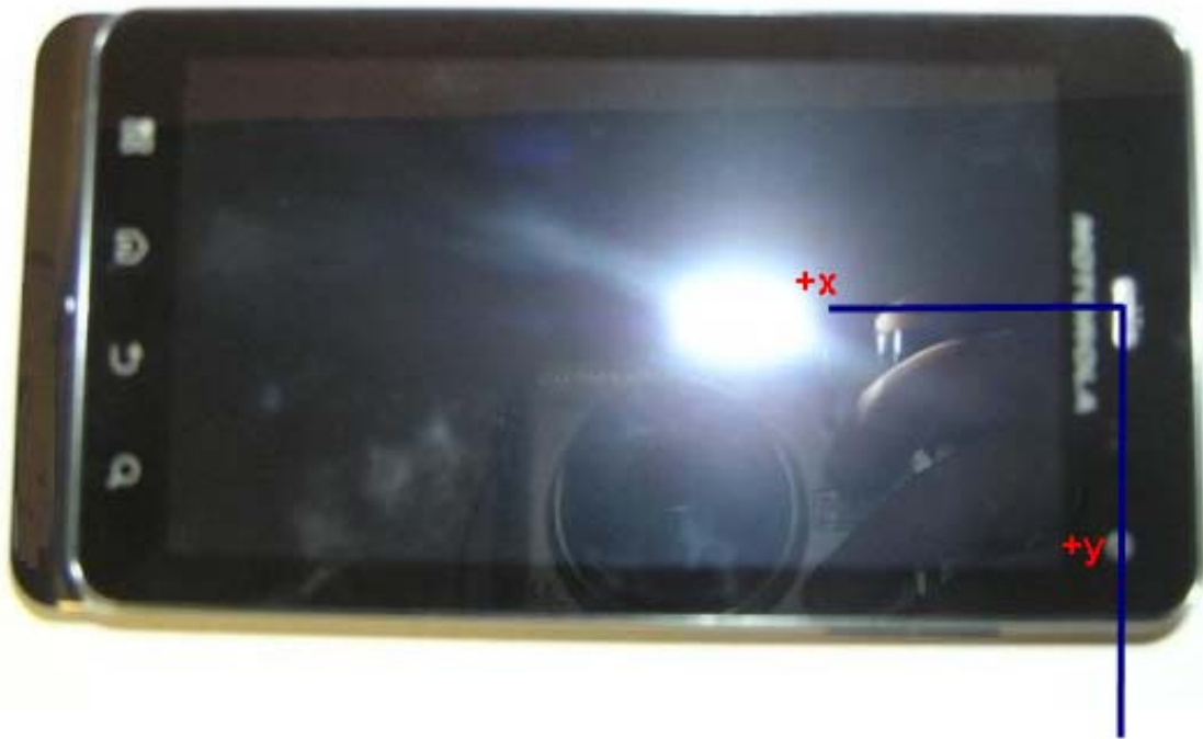
Figure 5. Coordinate Axis for T-coil Measurements