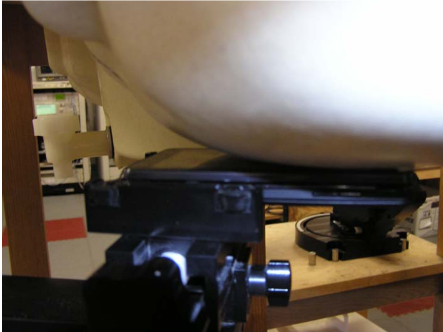
Figure 4: Cheek Position