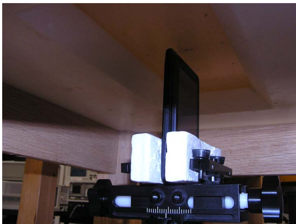
Figure 9: Mobile Hotspot Position at 10mm away from phantom Short edge of phone (top or bottom)