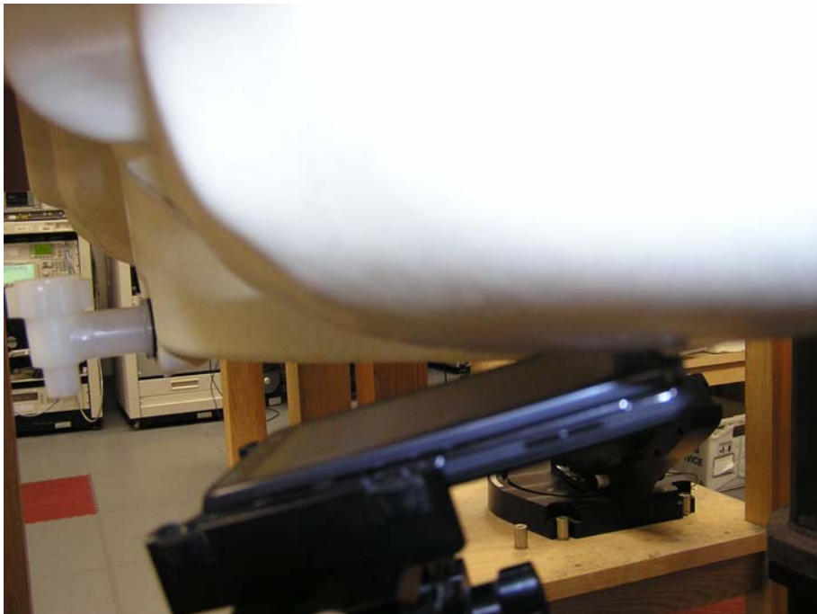
Figure 5: Tilt Position