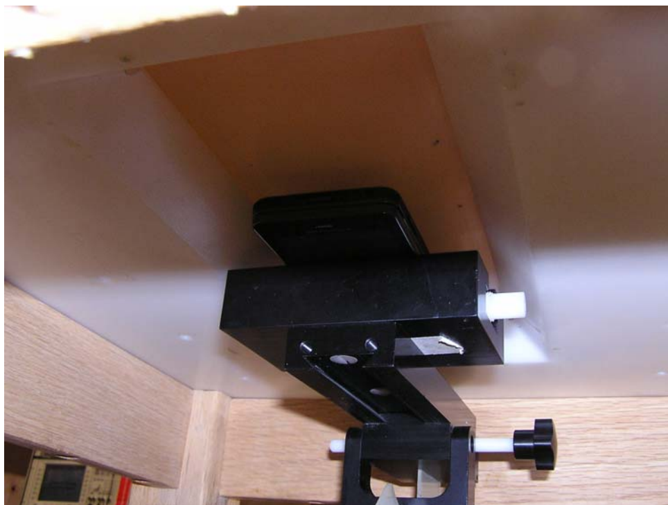
Figure 7: Mobile Hotspot Position at 10mm away from phantom (back of phone)