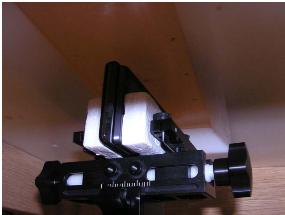
Figure 8: Mobile Hotspot Position at 10mm away from phantom Long edge of phone (right or left)