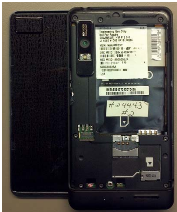
Figure 12: Back of Phone with Slider Open. No Antennas are located in upper slider.