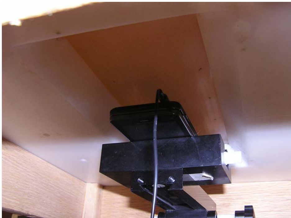
Figure 6: Body Position at 25mm away from phantom (back of phone)