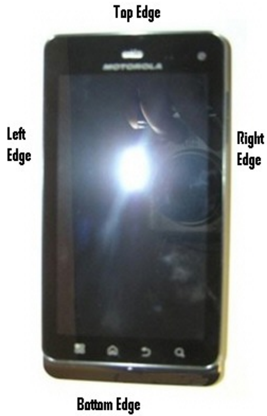
Figure 10: Edge Definition for Mobile Hotspot Testing