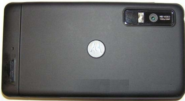
Figure 2: Phone Back