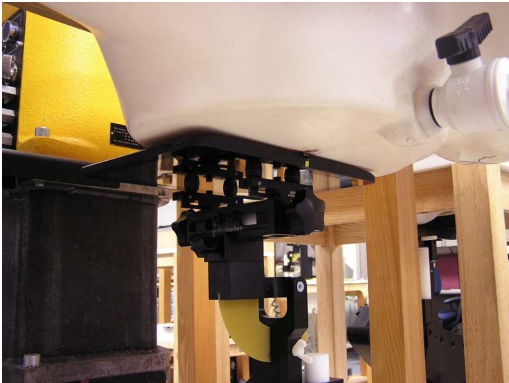
Figure 4: Back Surface of DUT toward Phantom, 0 mm Separation