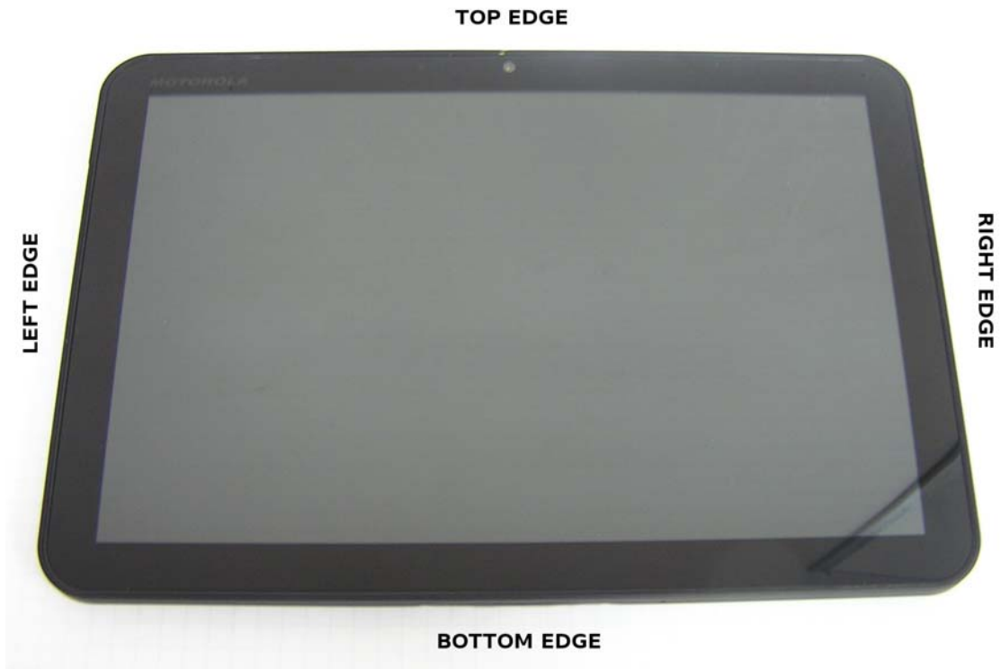
Figure 1: DUT Front Surface