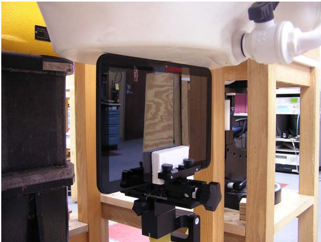
Figure 5: Top Edge of DUT toward Phantom, 0 mm Separation