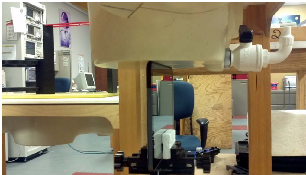
Figure 6: Top Edge of DUT toward Phantom, 0 mm Separation