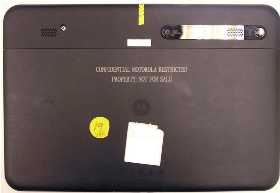
Figure 2: DUT Back Surface