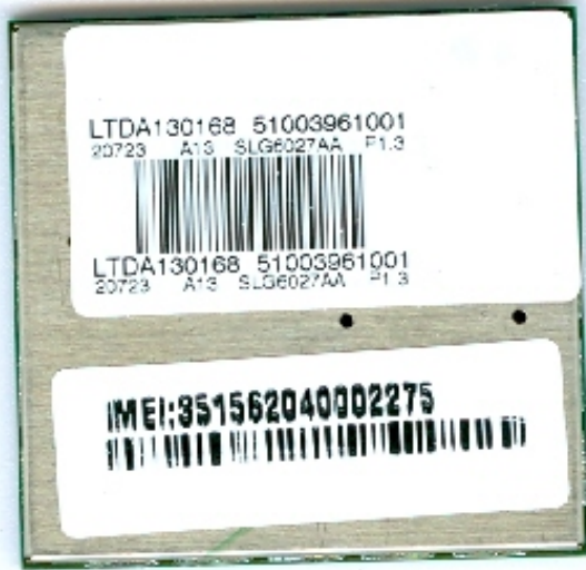
Top View of HTM1100-L