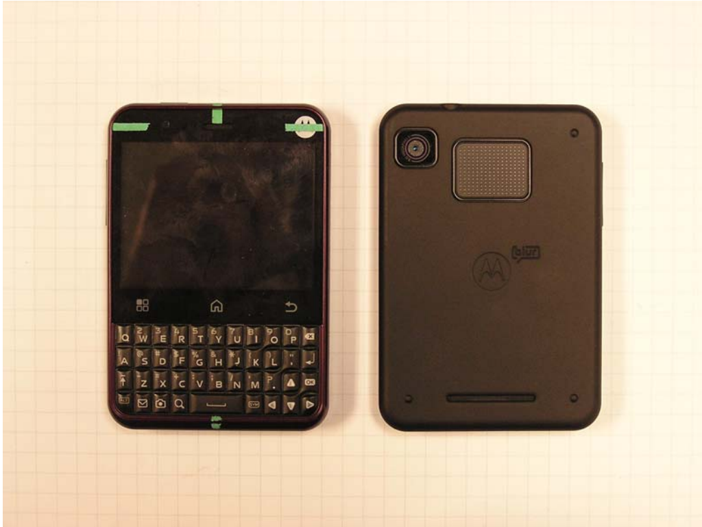
Figure 1: Phone Front and Back, Flip Closed