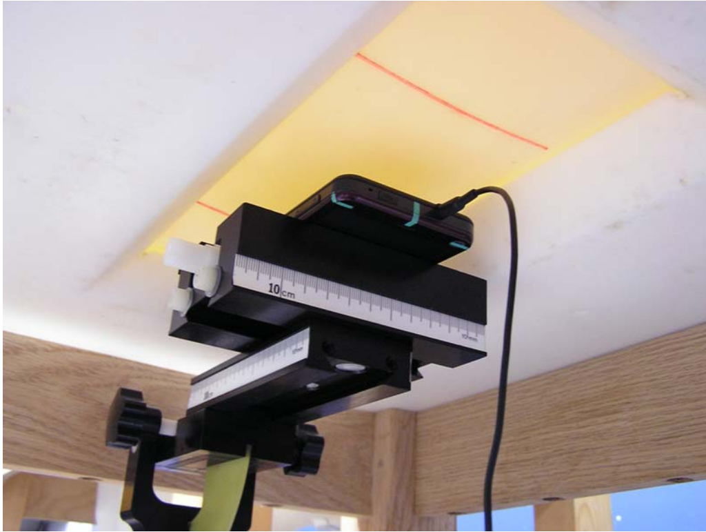
Figure 6: Body Position