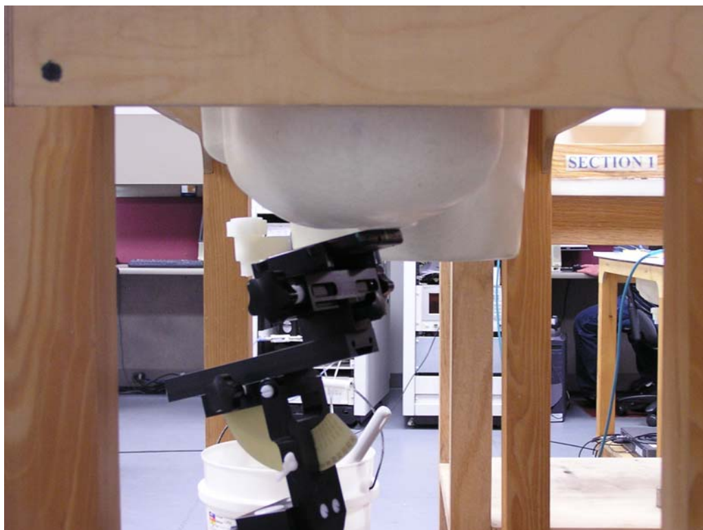
Figure 5: Tilt Position, Top of Head of Phantom