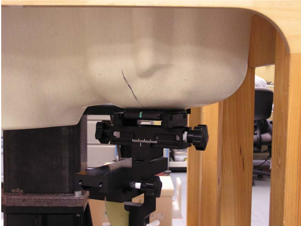
Figure 2: Cheek Position, Front of Head of Phantom