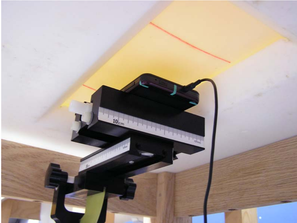
Figure 6: Body Position