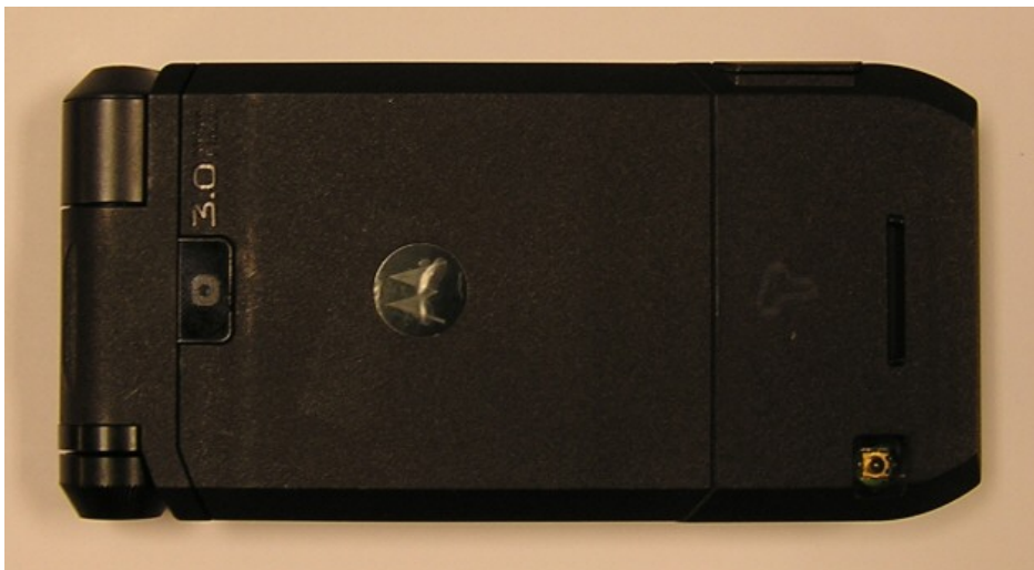
Figure 2: Phone Back, Flip Closed