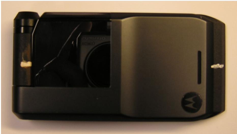
Figure 1: Phone Front, Flip Closed