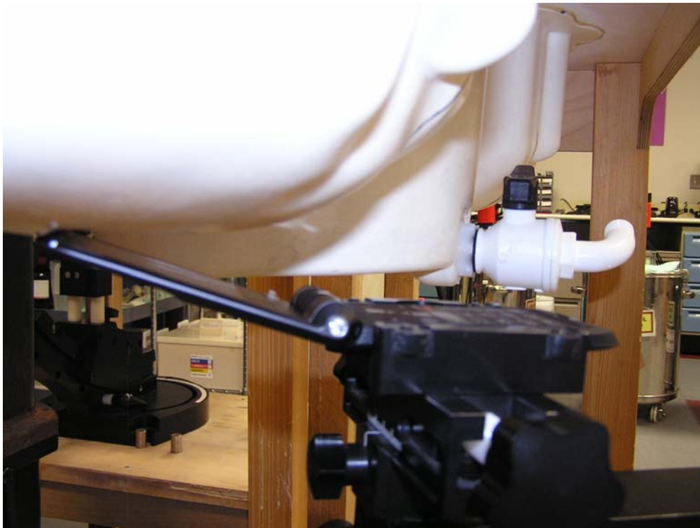
Figure 5: Tilt Position