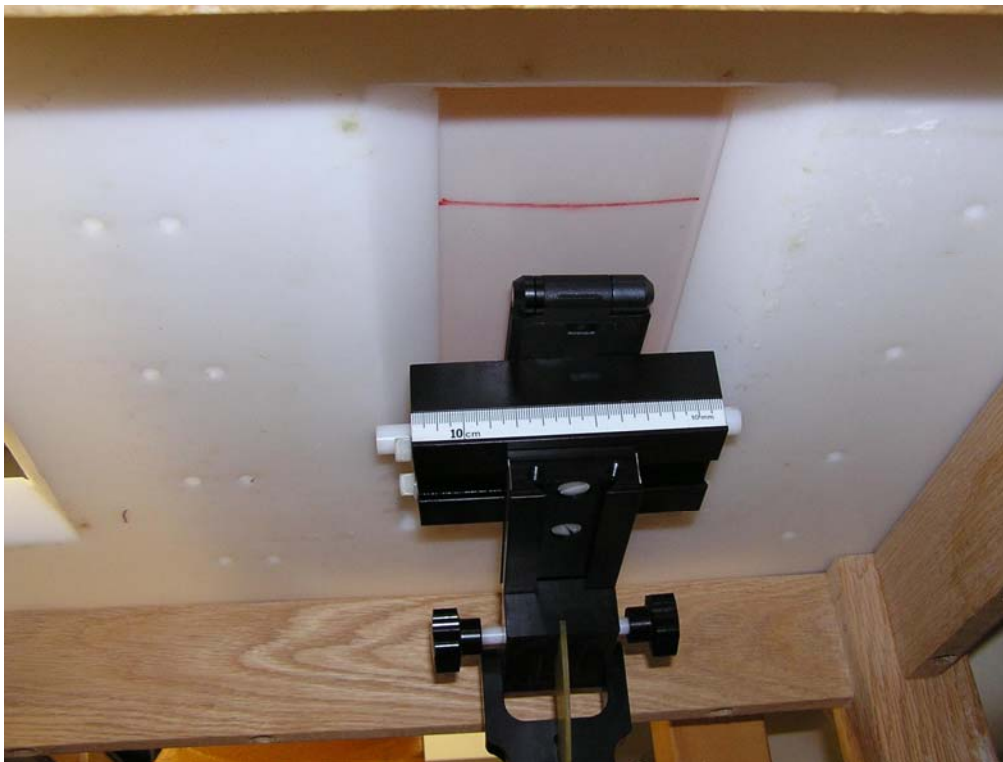
Figure 6: Body Position