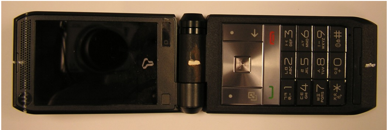
Figure 3: Phone Open