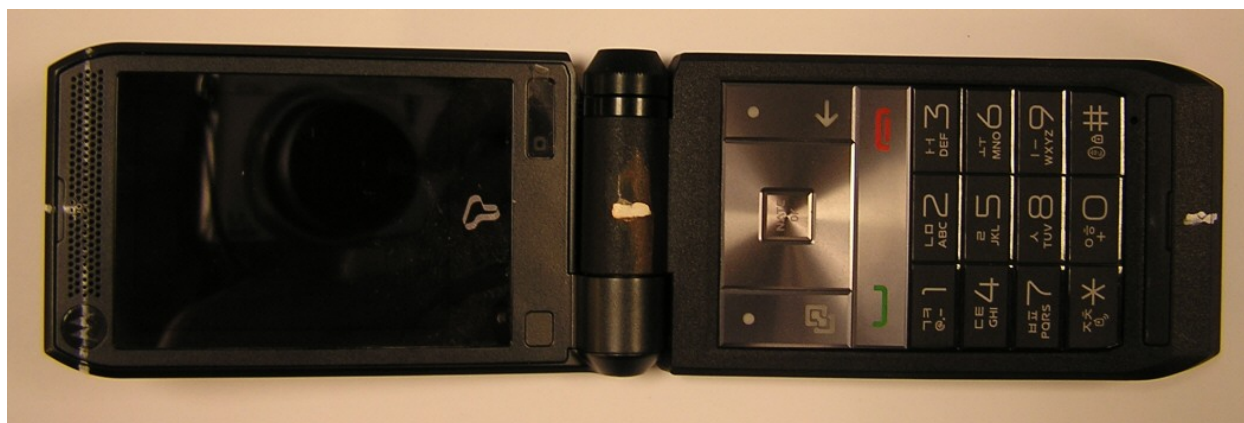
Figure 3: Phone Open