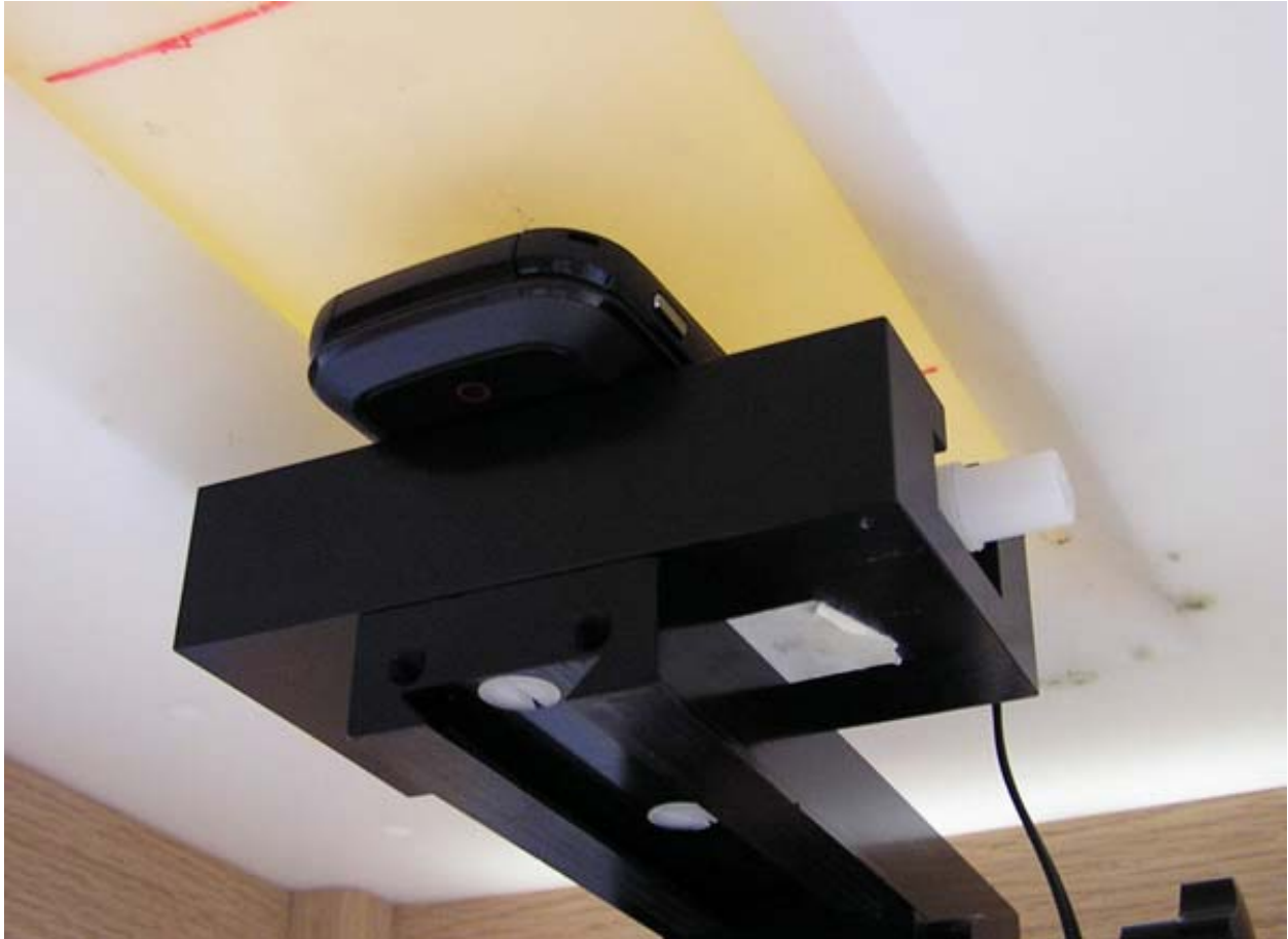
Figure 7: Body Position