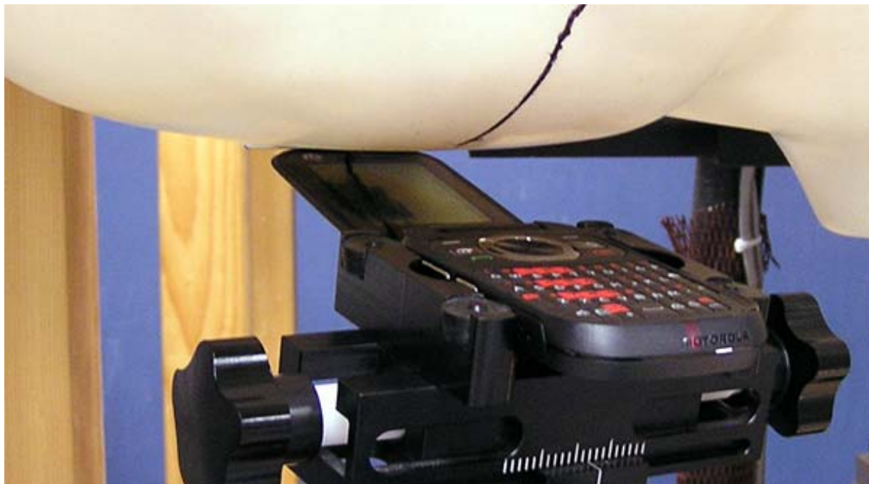
Figure 5: Tilt Position, Front of Head of Phantom