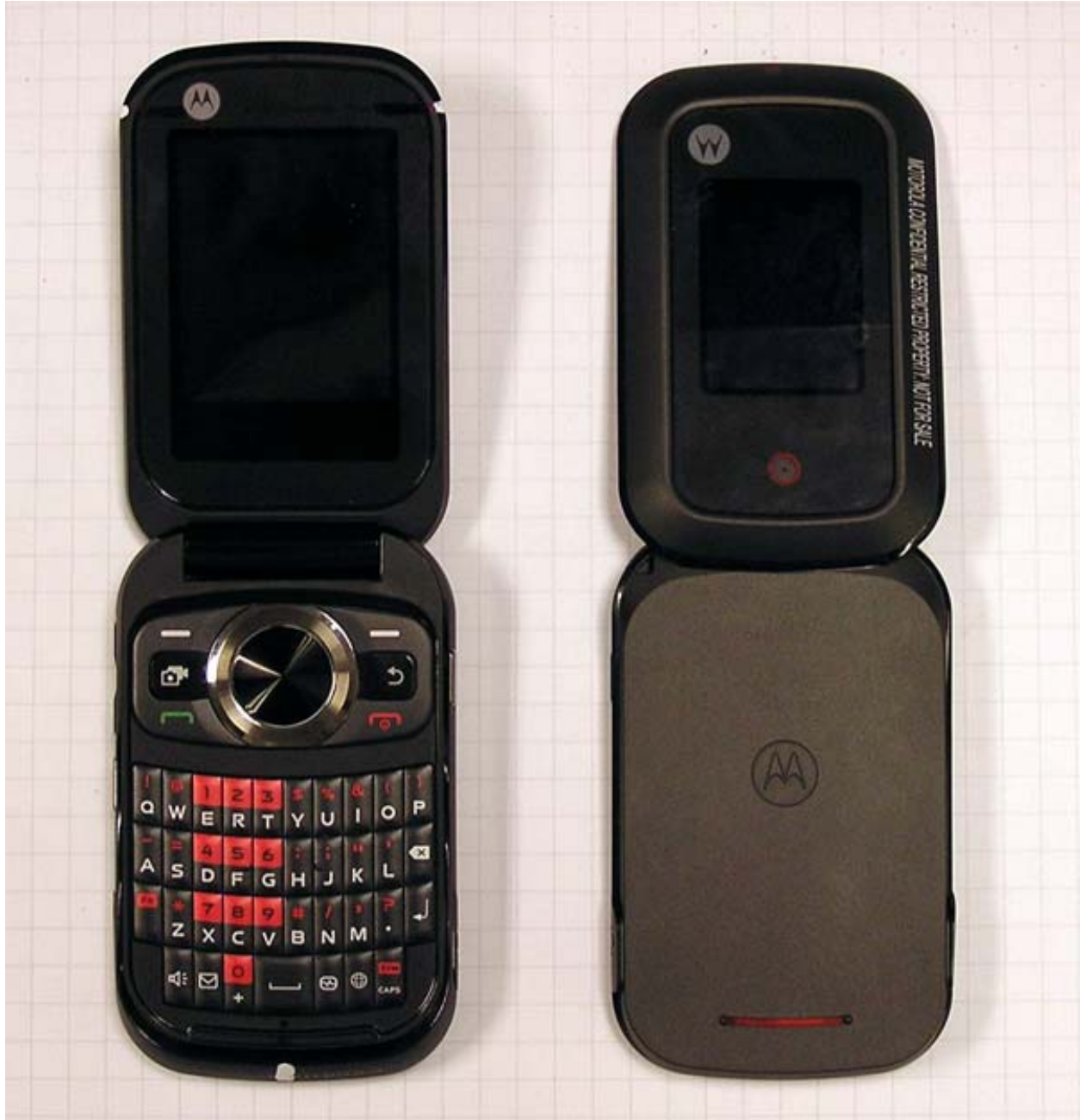
Figure 1: Phone Open Front and Back