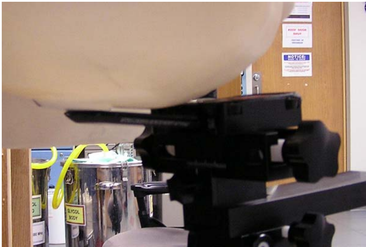
Figure 4: Cheek Position, Top of Head of Phantom