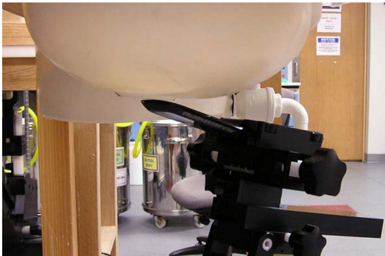
Figure 6: Tilt Position, Top of Head of Phantom