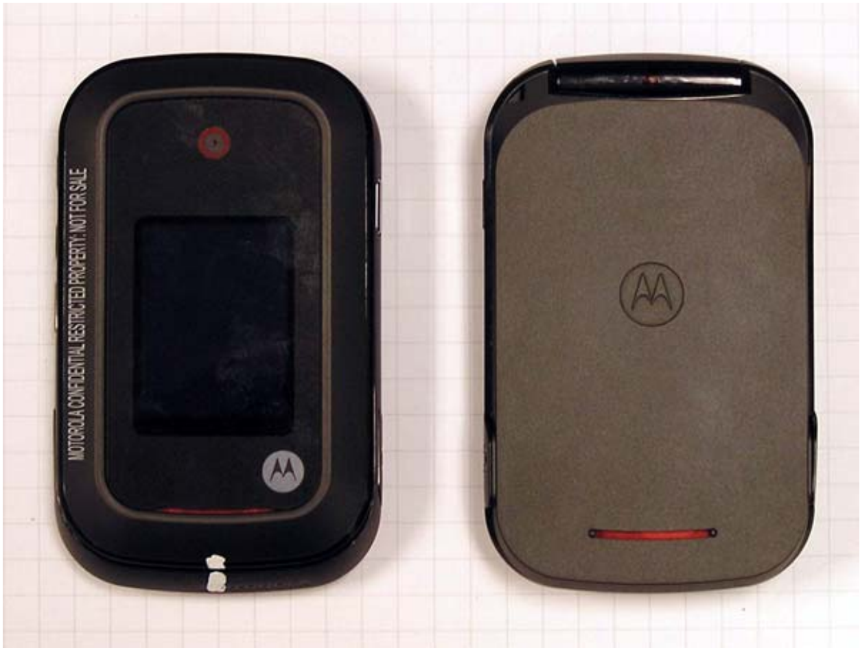
Figure 2: Phone Closed Front and Back