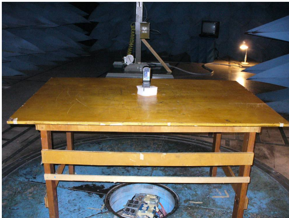
Photograph 8: Radiated Emissions Rear View Setup (EUT on the Bottom)