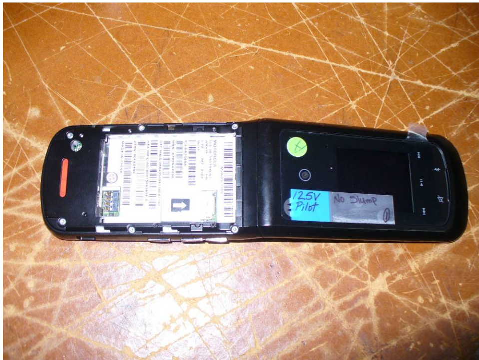
Photograph 2: EUT Back View