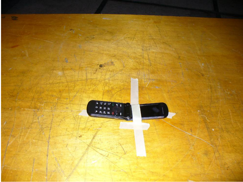
Photograph 5: Radiated Emissions Setup (EUT on the Back)