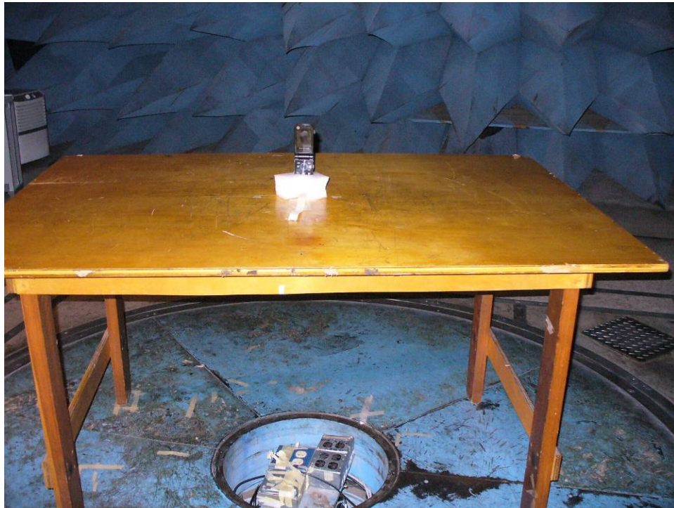
Photograph 7: Radiated Emissions Front View Setup (EUT on the Bottom)