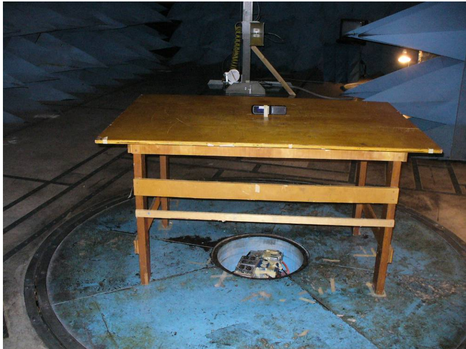
Photograph 4: Radiated Emissions Back View Setup (EUT on a Side)