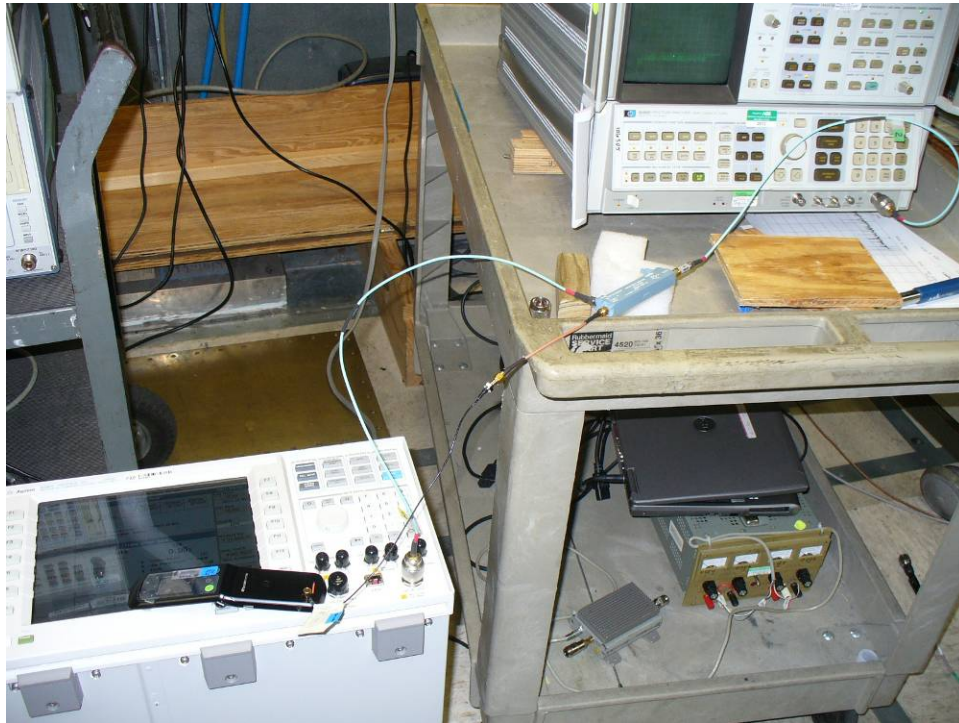
Photograph 9: Spurious Emissions at Antenna Terminals Setup