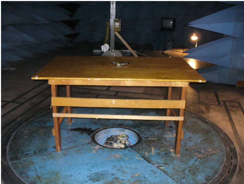
Photograph 6: Radiated Emissions Rear View Setup (EUT on the Back)