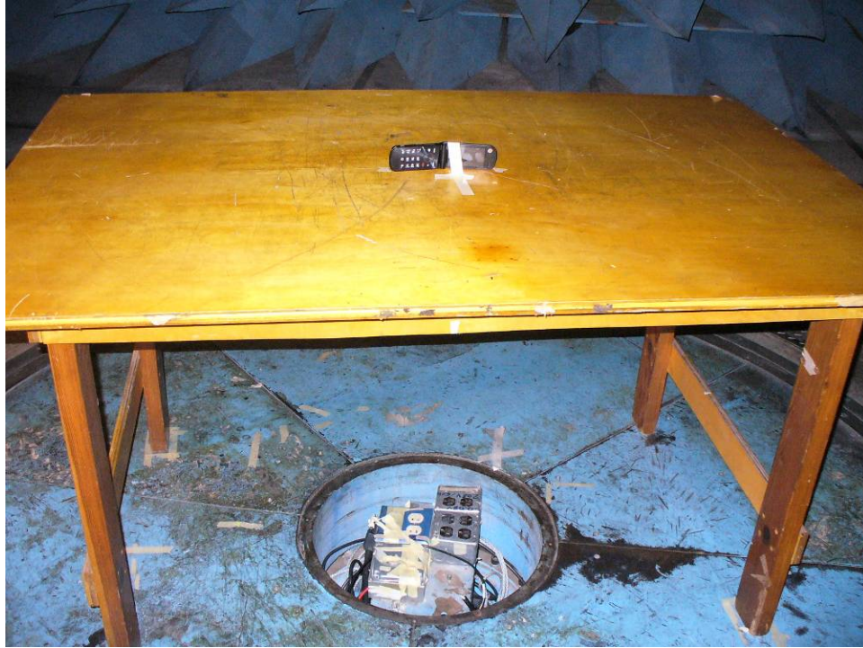
Photograph 3: Radiated Emissions Front View Setup (EUT on a side)