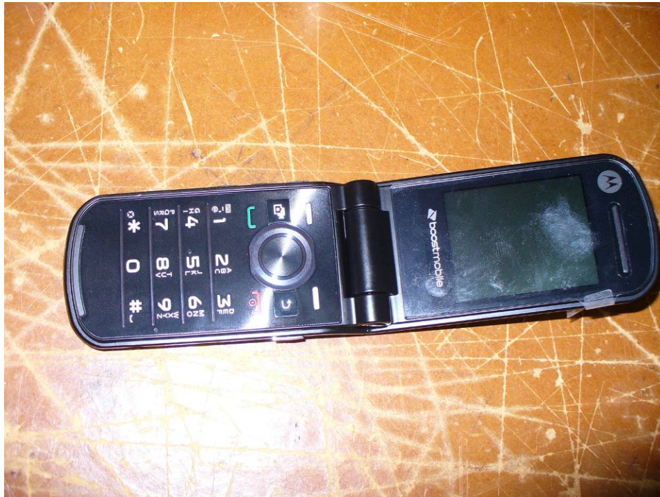
Photograph 1: EUT Front View