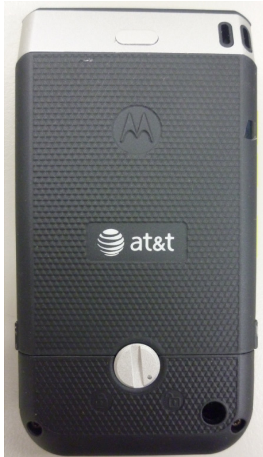
BACK OF PHONE