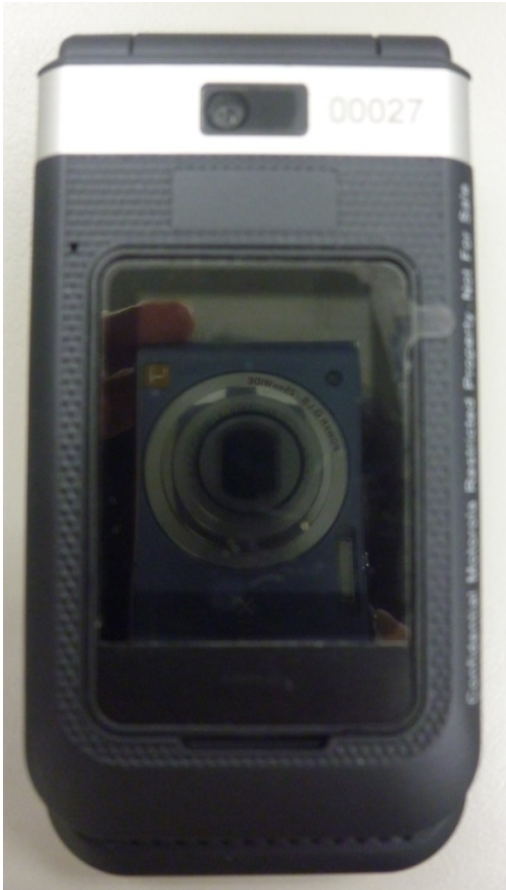
FRONT OF PHONE