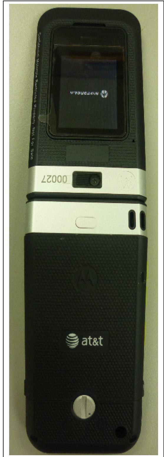
BACK OF PHONE FLIP OPEN