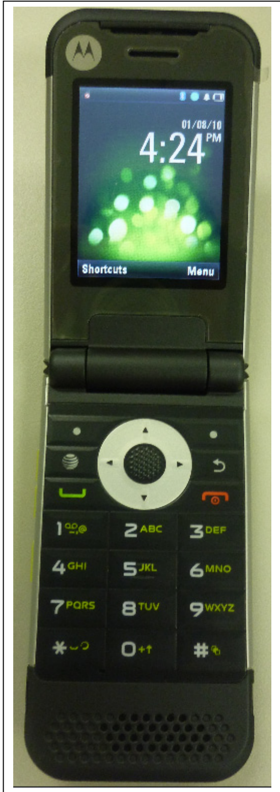
FRONT OF PHONE FLIP OPEN