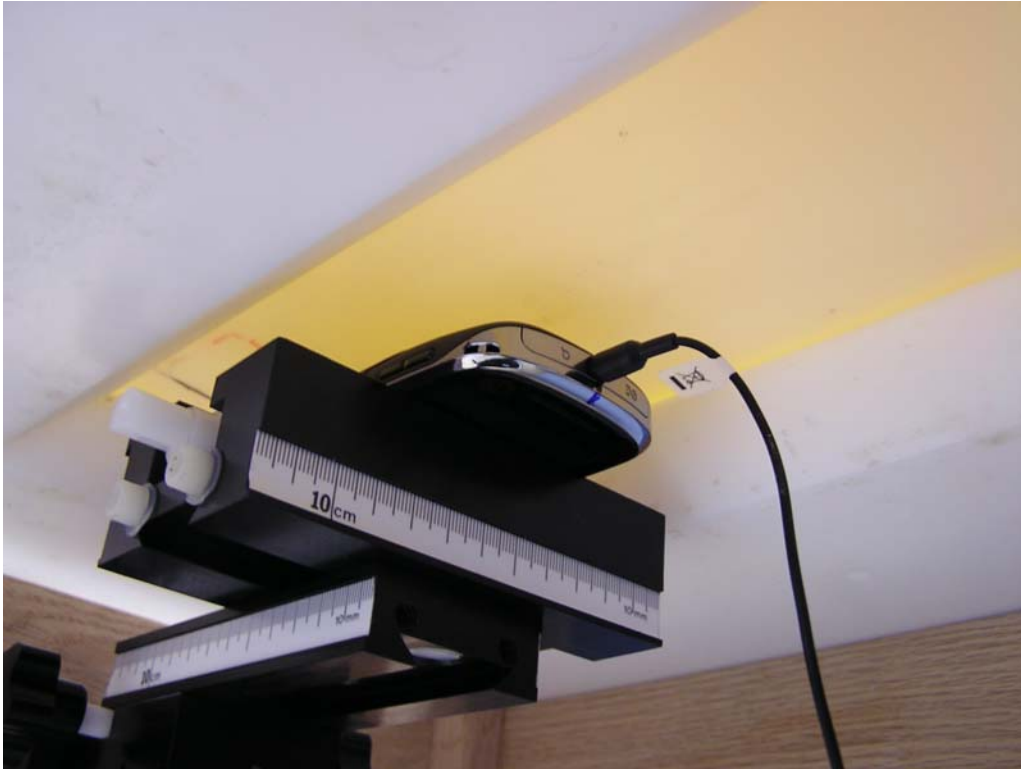
Figure 6: Body Position