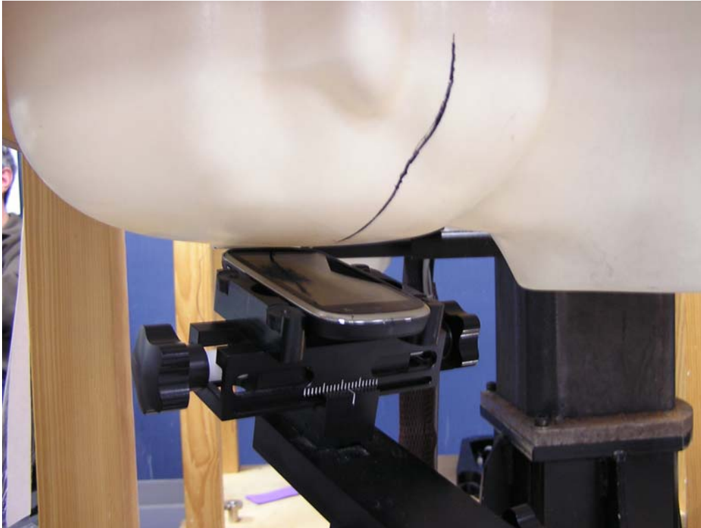
Figure 4: Tilt Position, Front of Head of Phantom