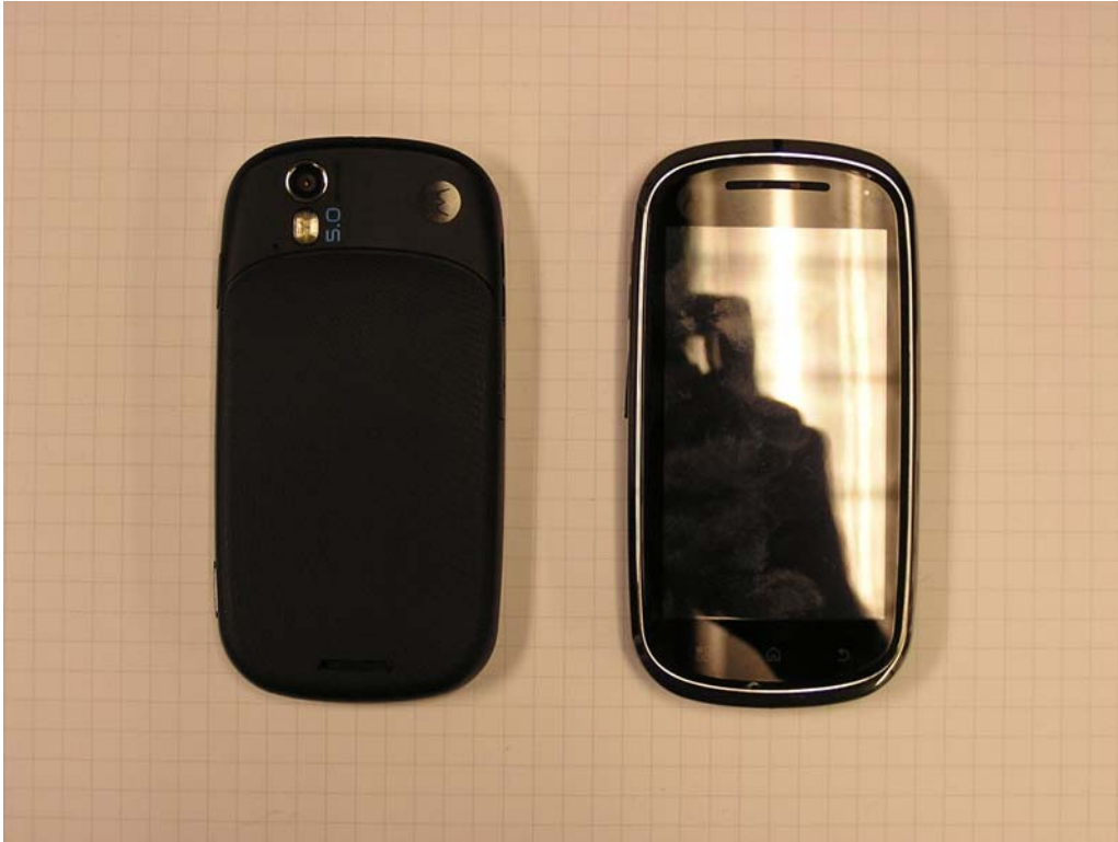
Figure 1: Phone Front and Back, Flip Closed