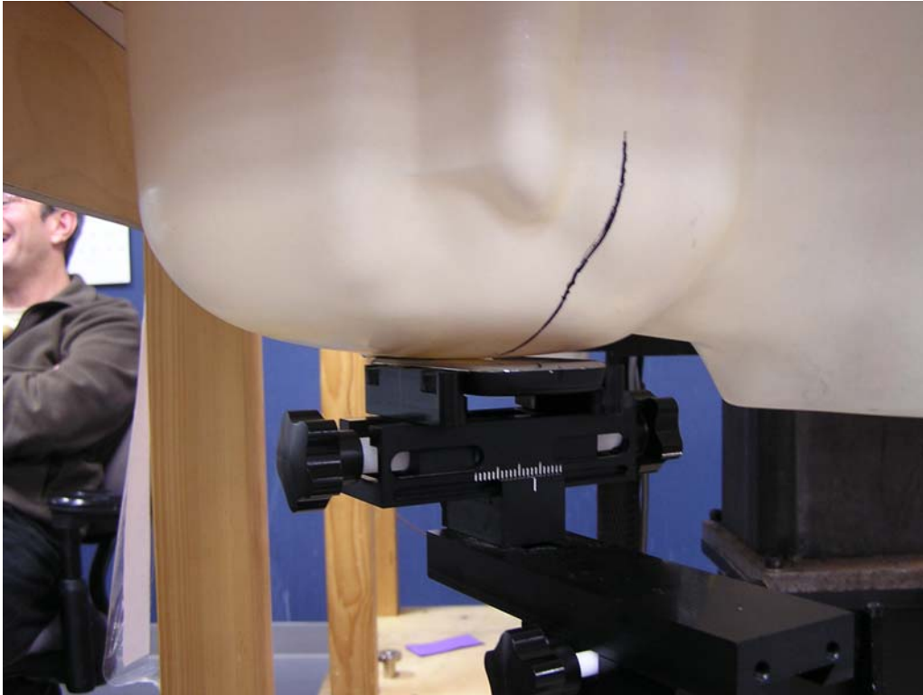
Figure 2: Cheek Position, Front of Head of Phantom