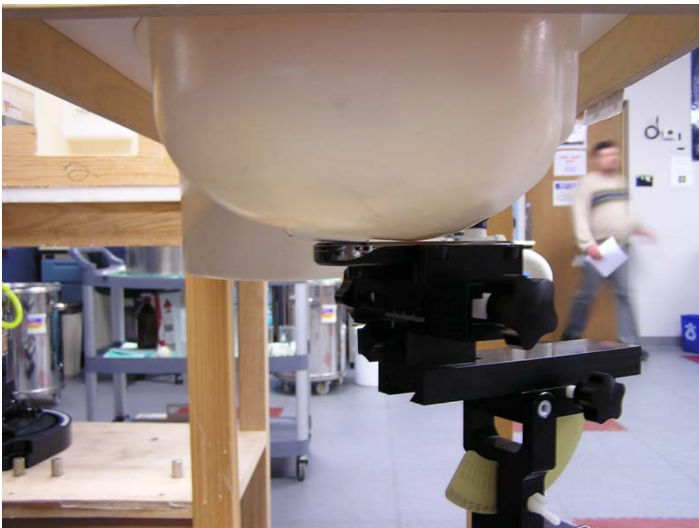
Figure 3: Cheek Position, Top of Head of Phantom