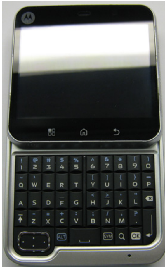
FRONT OF PHONE BLADE OPEN