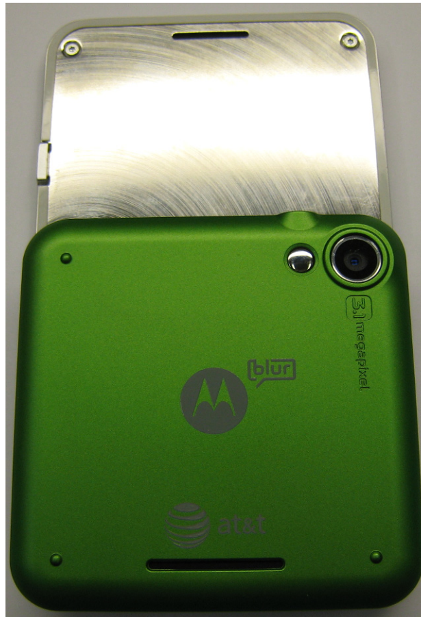
BACK OF PHONE BLADE OPEN