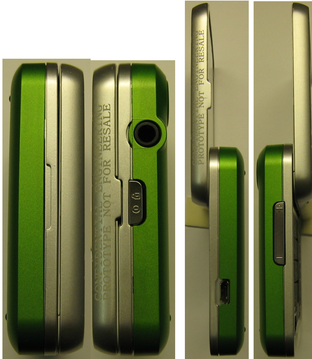
SIDE OF PHONE