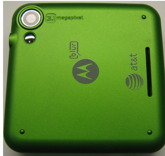
BACK OF PHONE