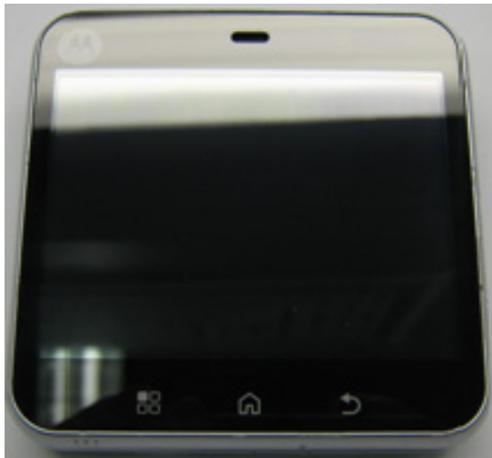
FRONT OF PHONE