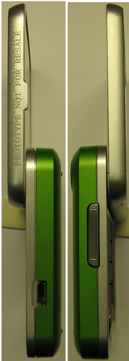
SIDE OF PHONE