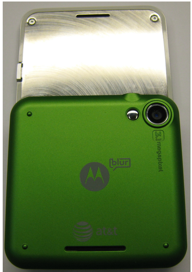
BACK OF PHONE BLADE OPEN