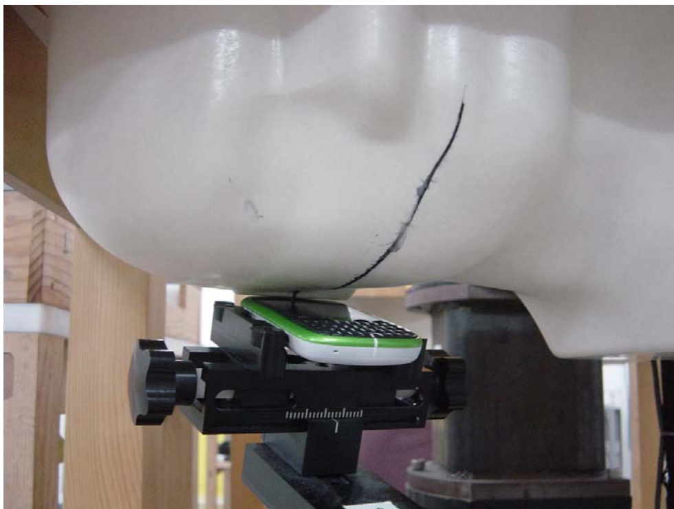
Figure 4: Phone Against the Head Phantom (15° Tilt)