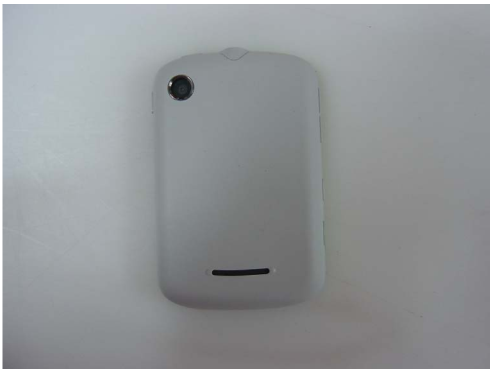
Figure2: Back of Phone