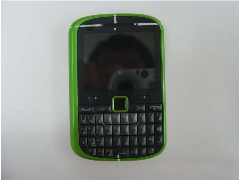
Figure1: Front of Phone