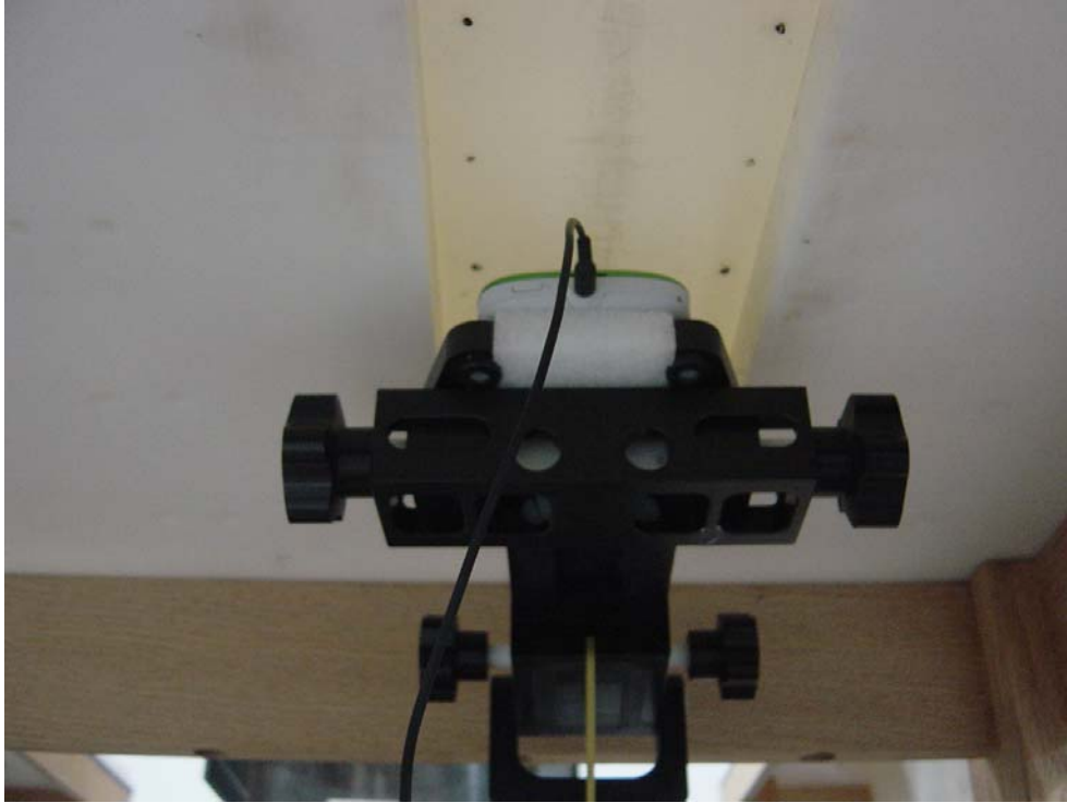
Figure 5: Phone Against the Flat Phantom