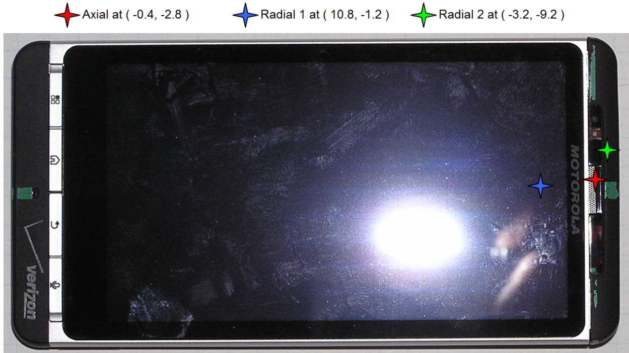
Figure 5. Location of point measurements for ABM (Telecoil) Emissions