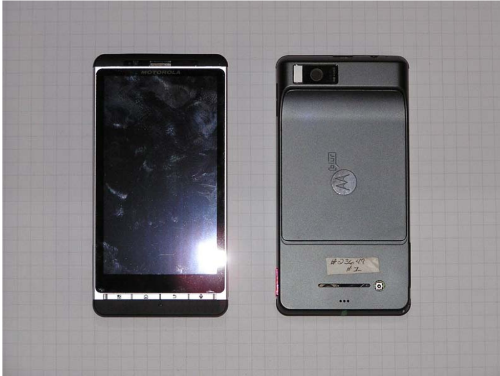
Figure 1. Phone Front and Back