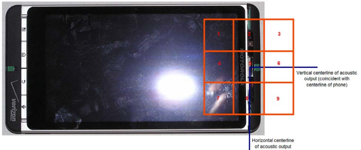
Figure 2. Phone Front - Orientation and Measurement Plane for RF Emissions Testing