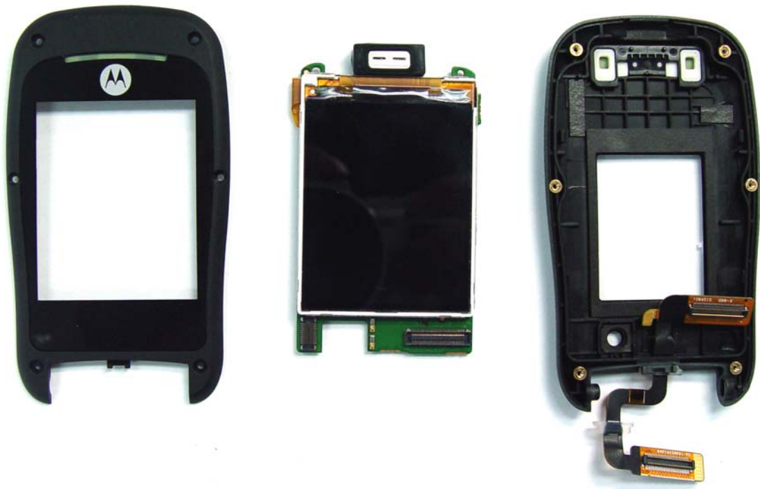
INSIDE FLIP HOUSING