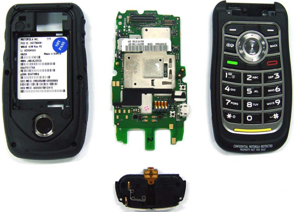
INSIDE MAIN HOUSING