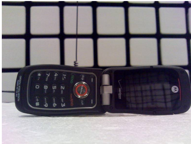
23145-1, IHDT56KS1 placed in test position Y