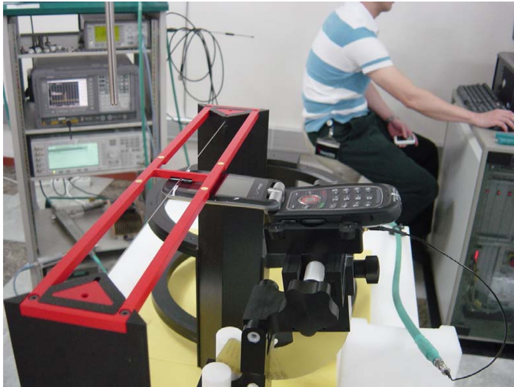
Figure 7. Positioning and Measurement for T-coil