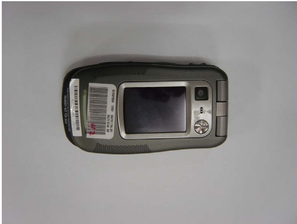
Figure 1. Phone Closed