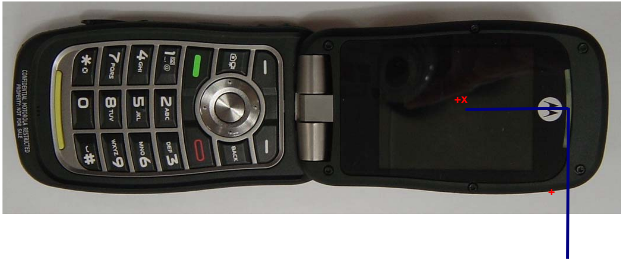
Figure 5. Coordinate Axis for T-coil Measurements