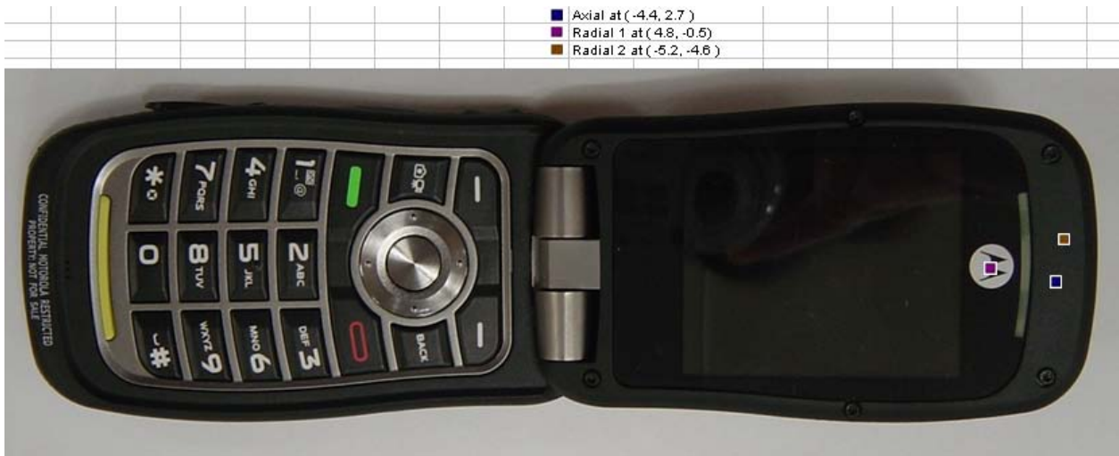
Figure 6. Location of Measured Points for T-coil measurements