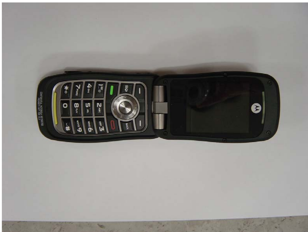
Figure 2. Phone Open