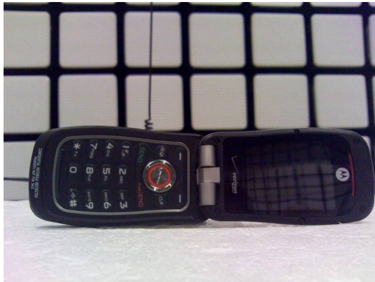
23127-1, IHDT56KR1 placed in test position Y