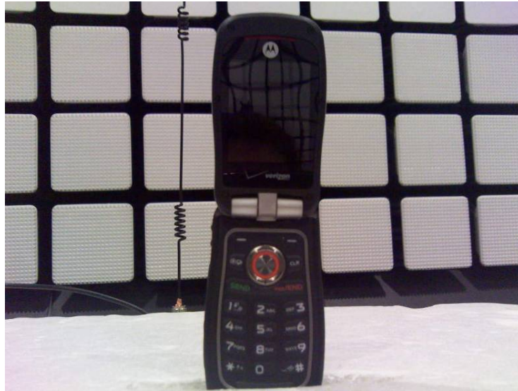
23127-1, IHDT56KR1 placed in test position Z