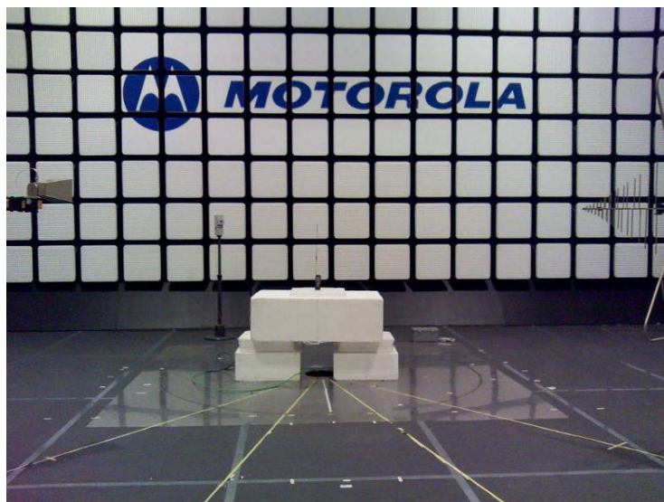
23127-1, IHDT56KR1 setup in semi-anechoic chamber – front view (30 MHz – 18 GHz)