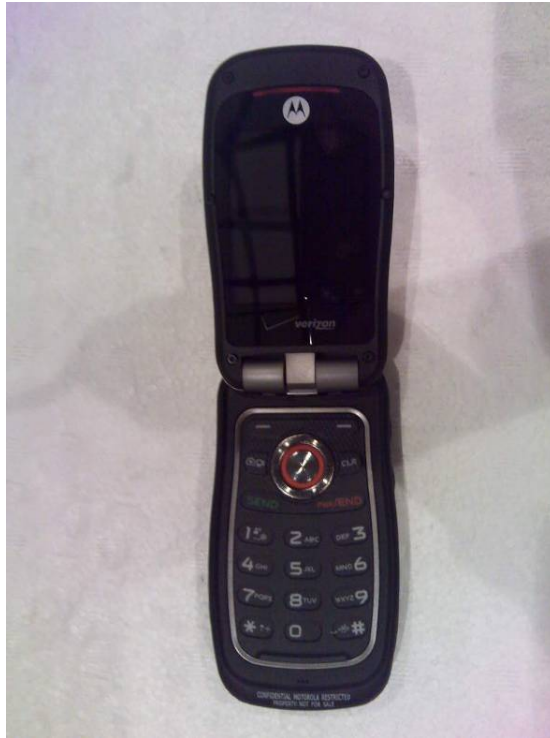
23127-1, IHDT56KR1 placed in test position X