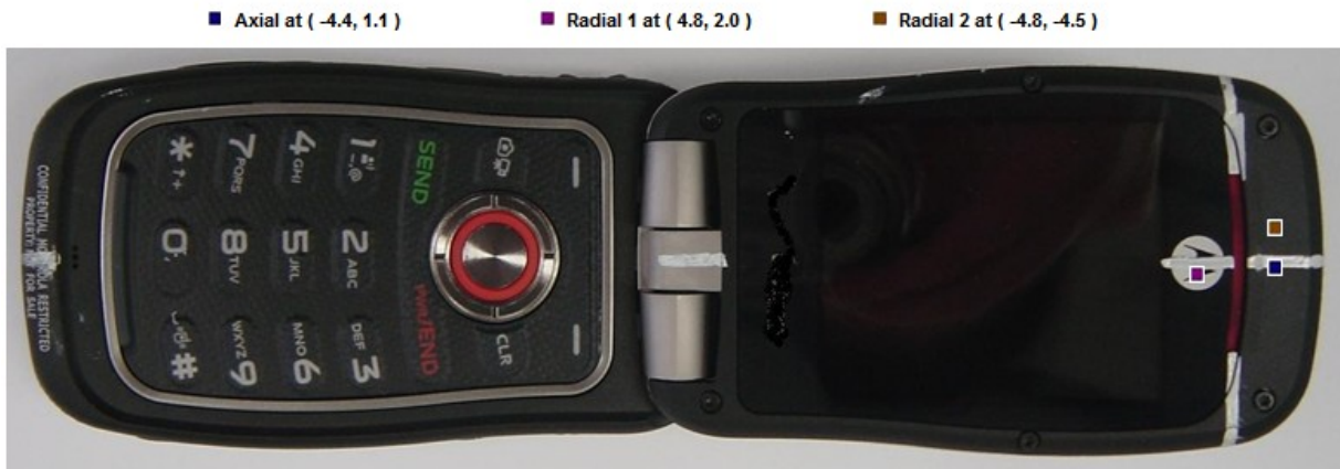
Figure 8. Location of Measured Points for T-coil measurements