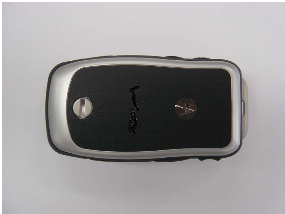
Figure 2. Phone Back - Closed