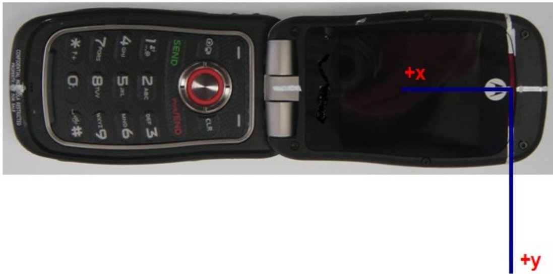
Figure 7. Coordinate Axis for T-coil Measurements