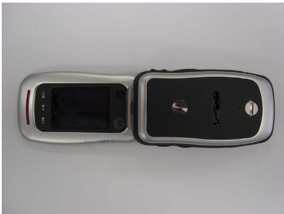
Figure 4. Phone Back - Open