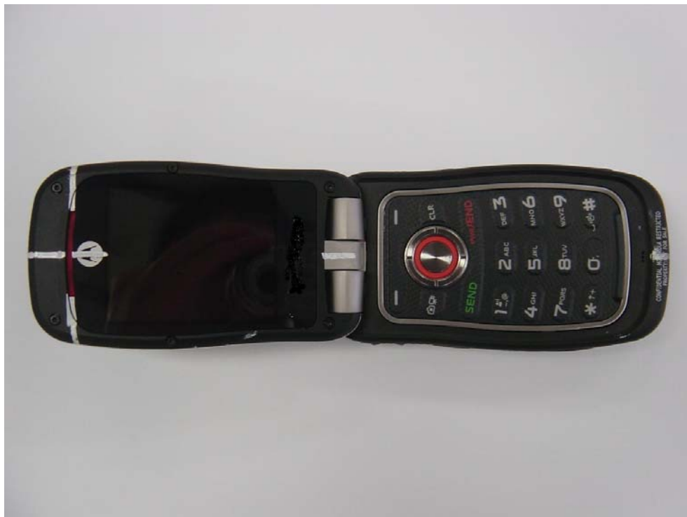
Figure 3. Phone Front - Open