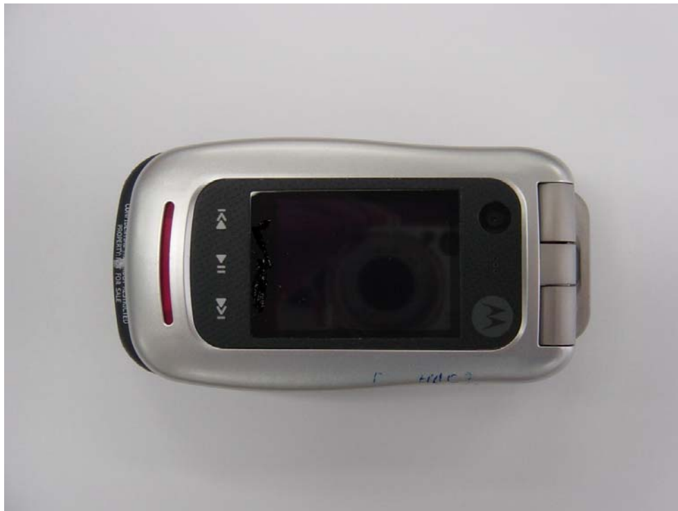
Figure 1. Phone Front - Closed