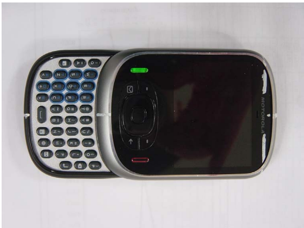
Figure 2. Phone Open