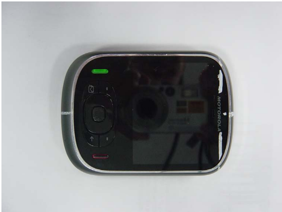
Figure 1. Phone Closed