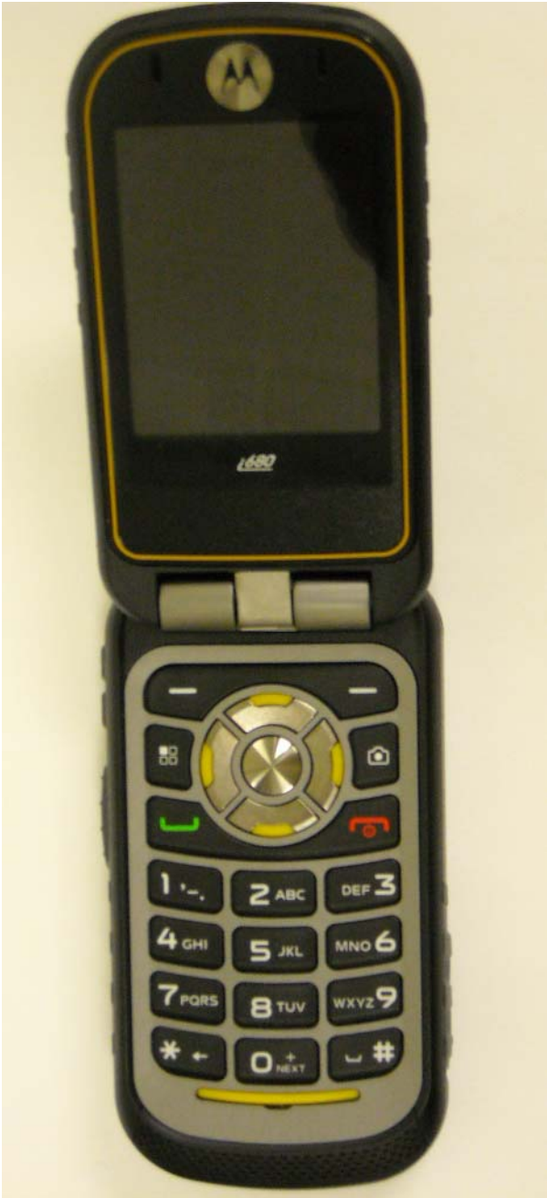
Figure 3-3. Front of radio