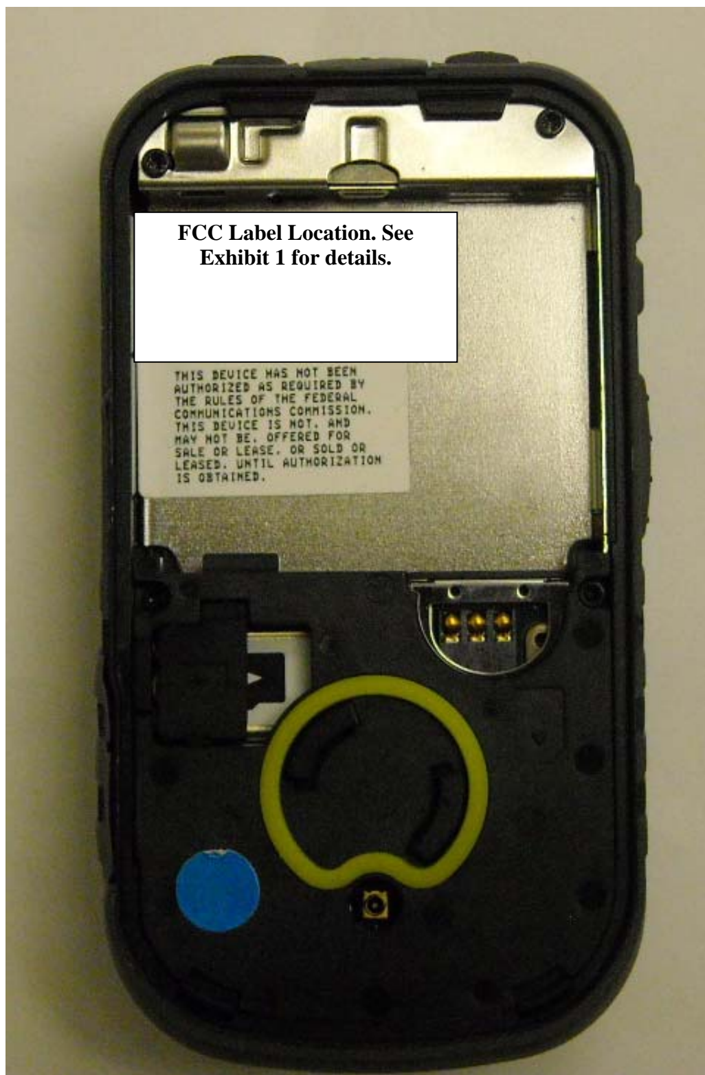
Figure 3-9. Interior Compartment of radio