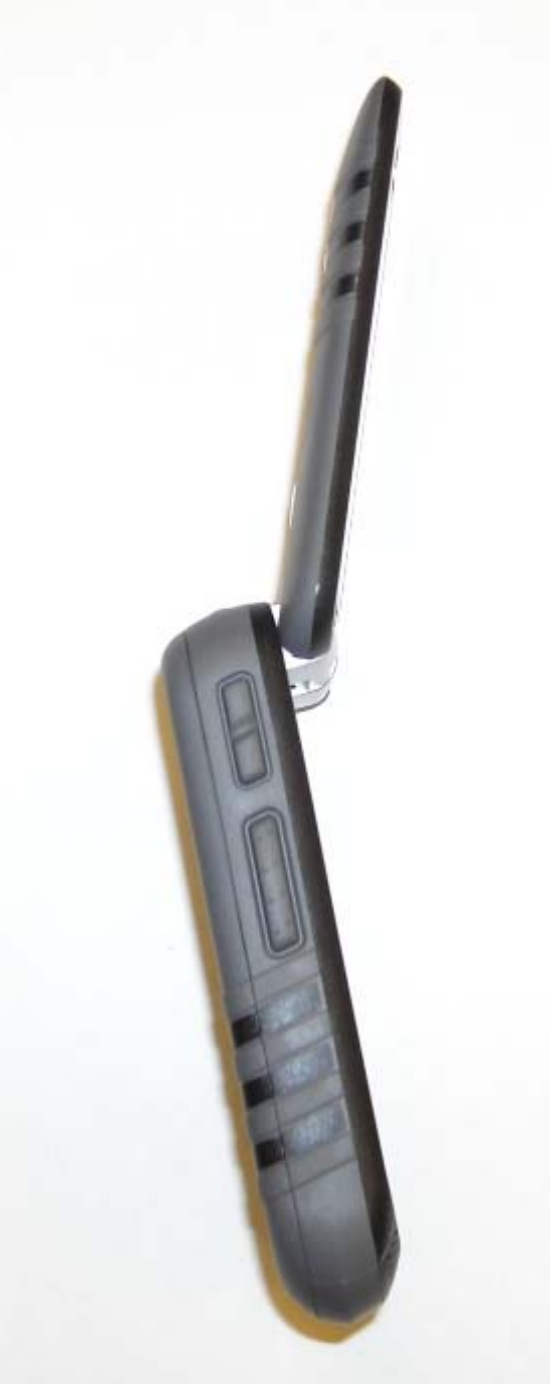
Figure 3-5. Button Side of radio