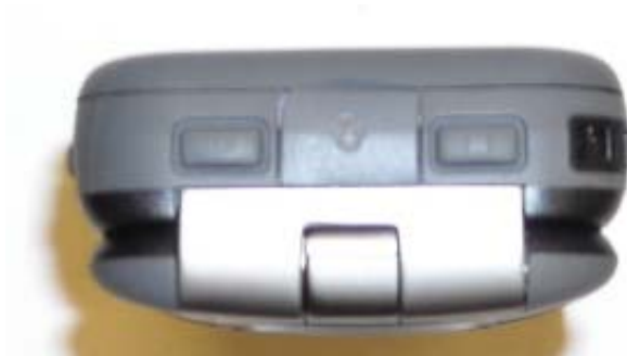
Figure 3-7. Top of radio