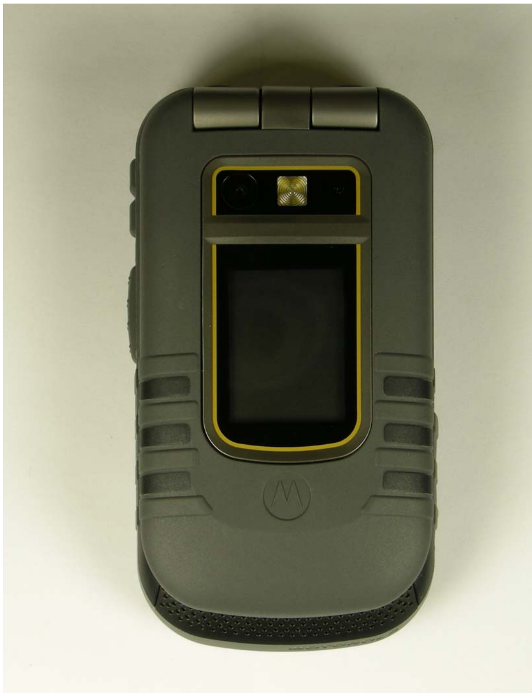
Figure 3-1. Front of radio

The radio product shapes, colors and housings/bezels may vary.