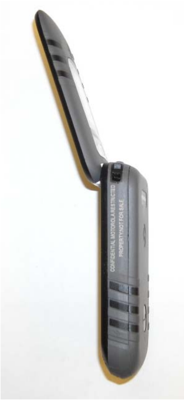
Figure 3-6. Opposite Side of radio