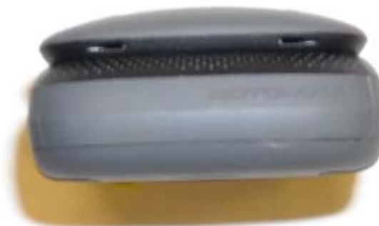
Figure 3-8. Bottom of radio