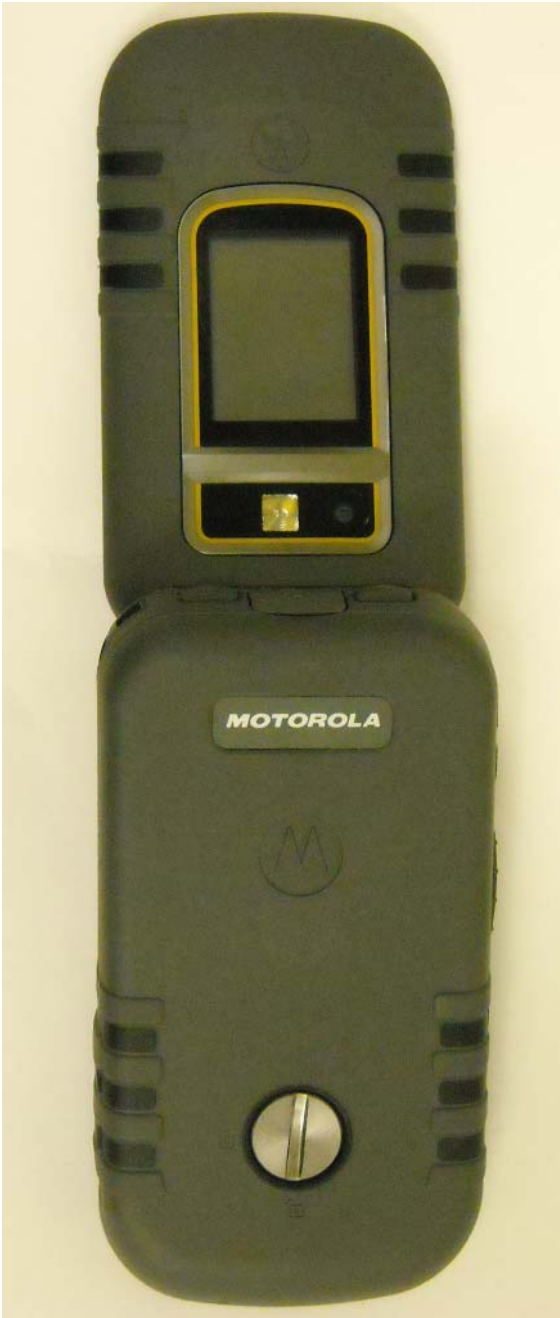
Figure 3-4. Back of radio