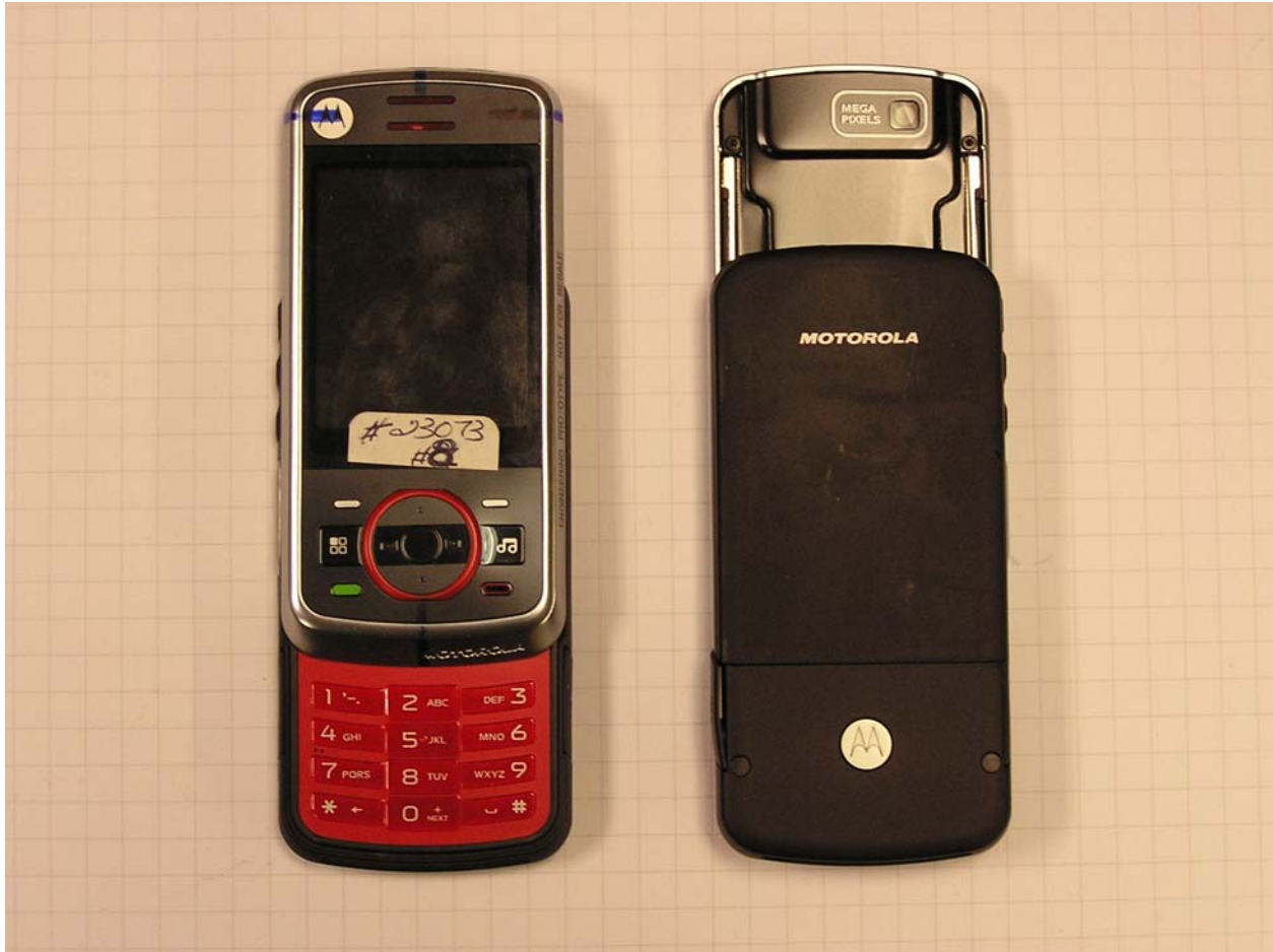
Figure 1. Phone Front and Back (Shown with Slider Open)