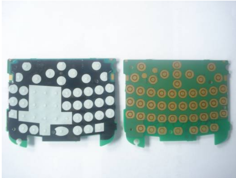
Keypad Board Front (With Domes and EL Lamp)