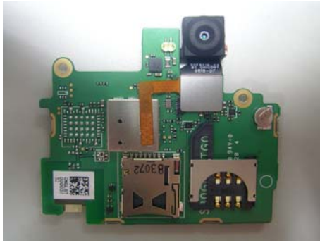
Daughter Board Front (With Shields and Camera Module)