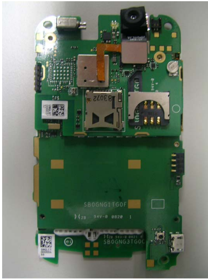
Main and Daughter Boards (Connected Together)