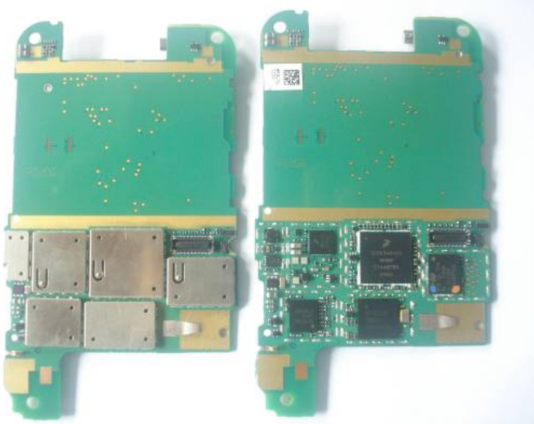
Main Board Front (With Shields)