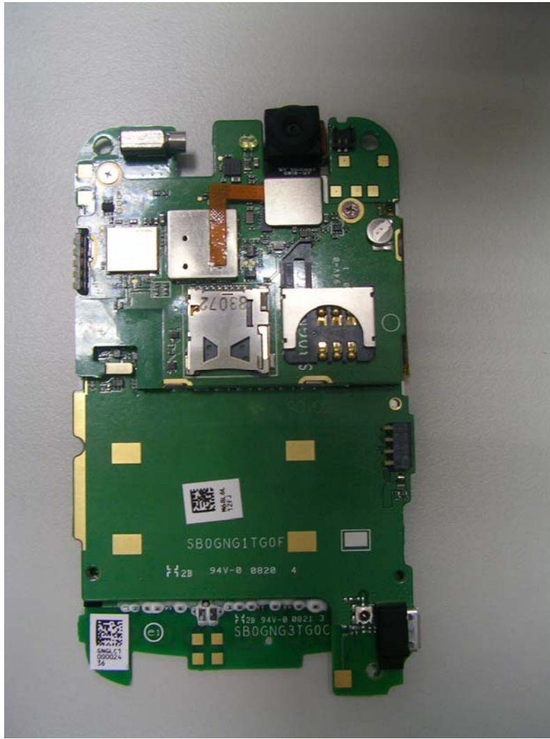
Main and Daughter Boards (Connected Together)