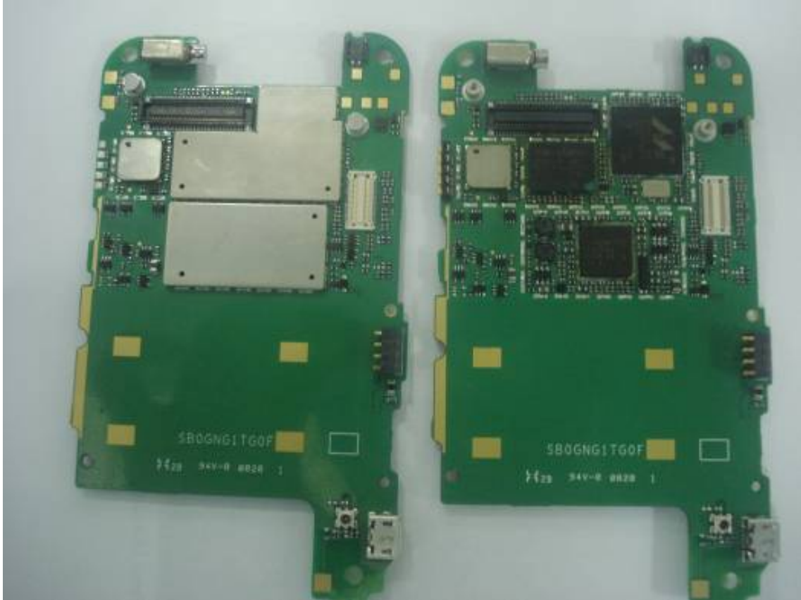
Main Board Back (With Shields)