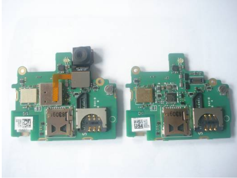
Daughter Board Front (With Shields and Camera Module)