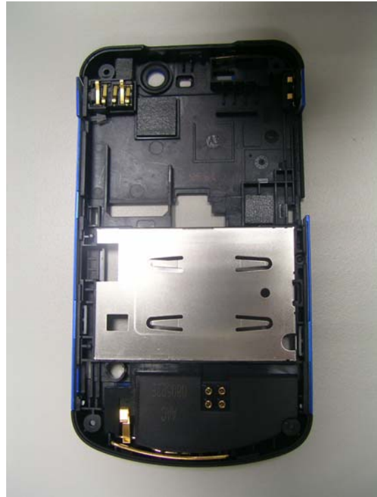
Inside Back Housing