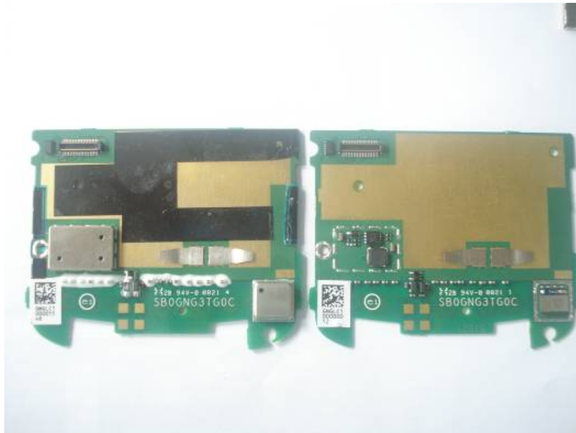
Keypad Board Back (With Shields)