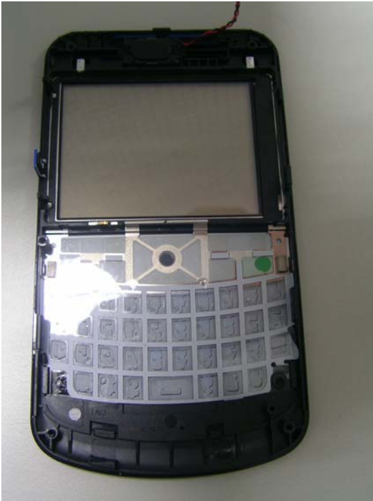
Inside Front Housing