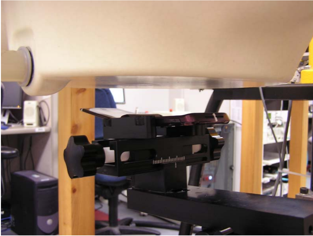
Figure 7. Push-To-Talk Position