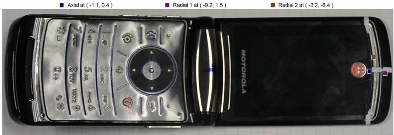
Figure 7. Location of Measured Points for Telecoil measurements