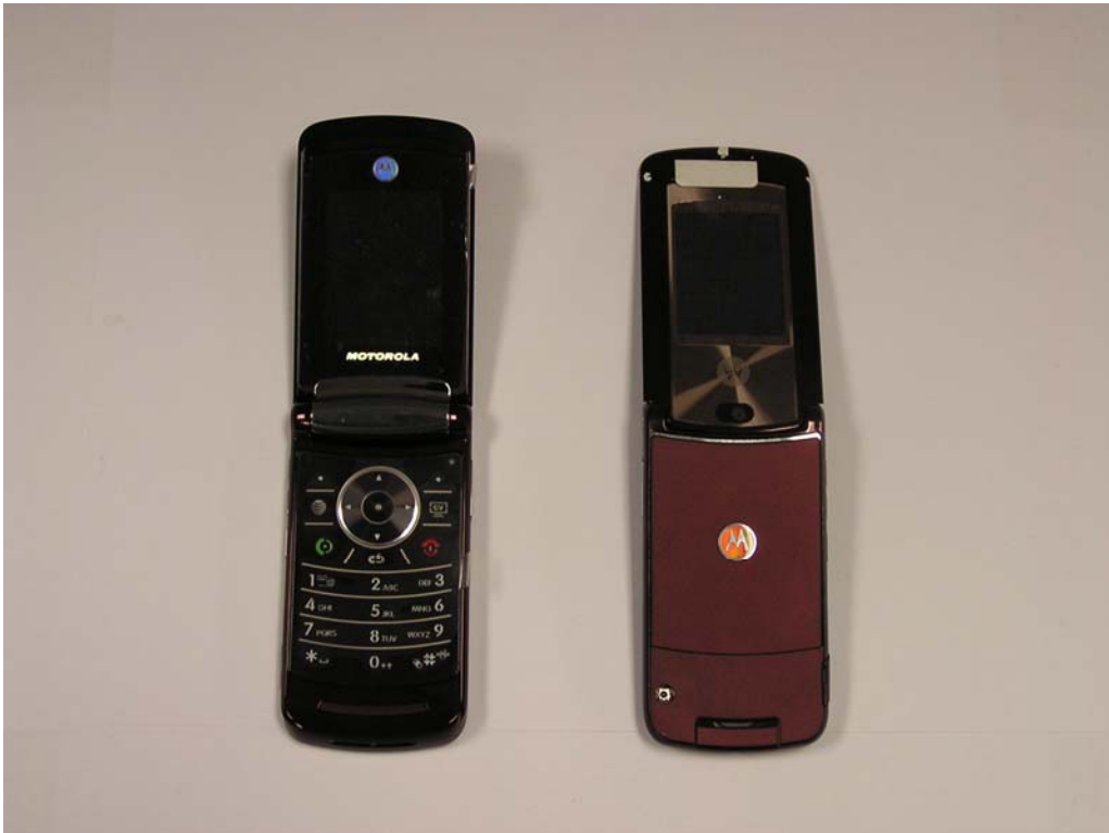
Figure 2. Phone Open