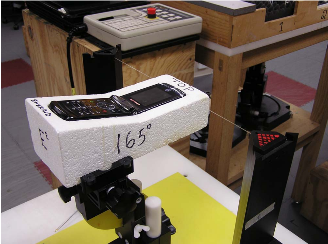
Figure 5. Measurement for RF Emissions