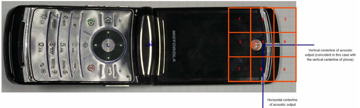
Figure 3. Phone Open - Orientation and Measurement Plane for RF Emissions Testing