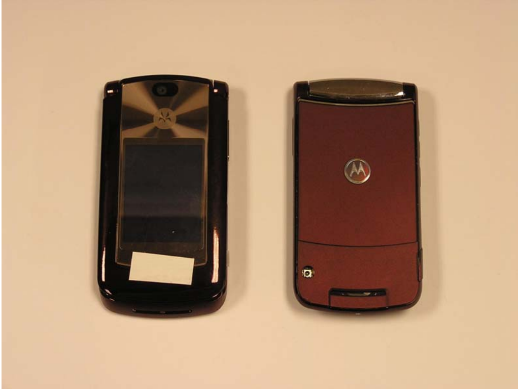
Figure 1. Phone Closed