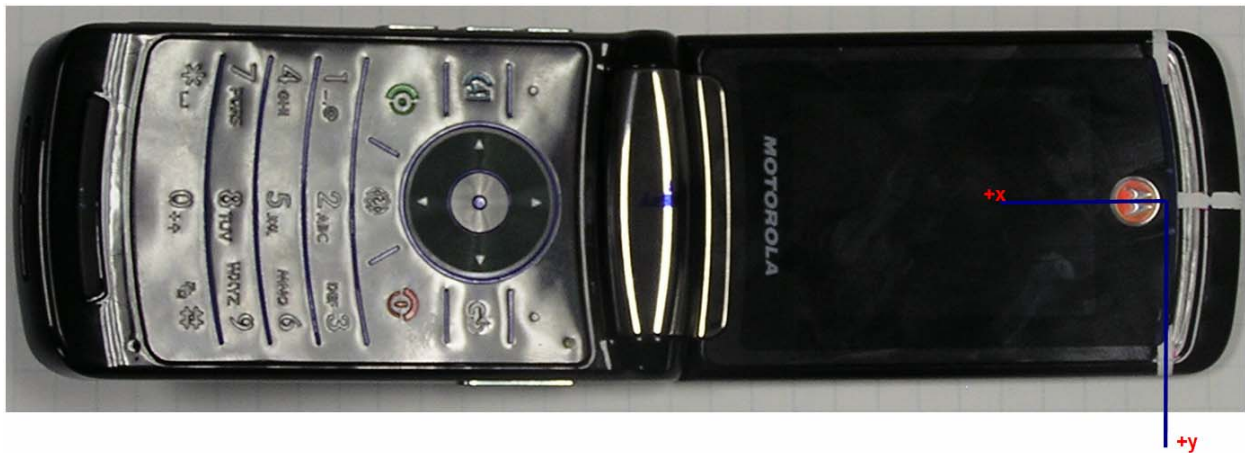
Figure 6. Coordinate Axis for Telecoil Measurements