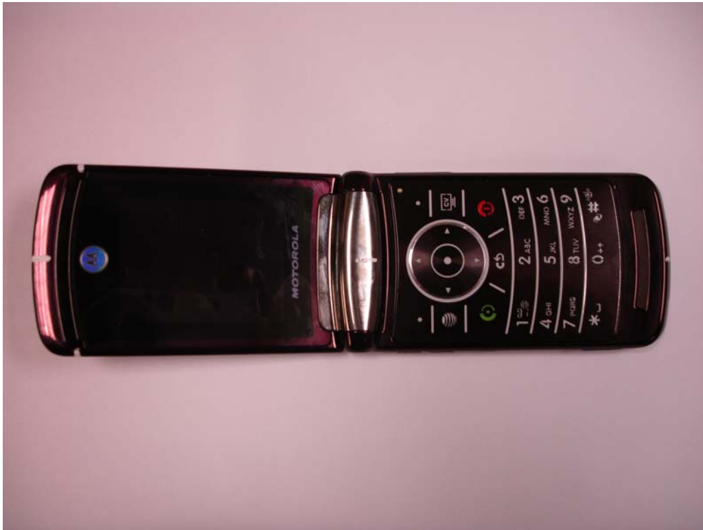
Figure 3. Phone Open