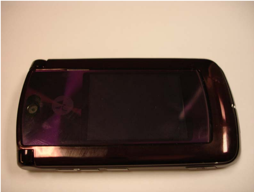
Figure 1. Front of Phone