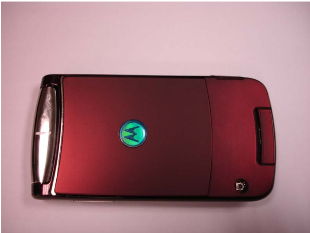
Figure 2. Back of Phone