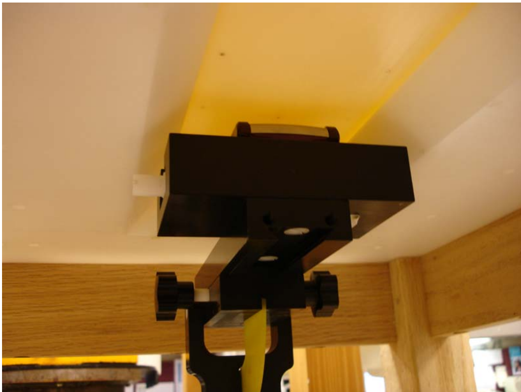
Figure 6. Body Worn Testing