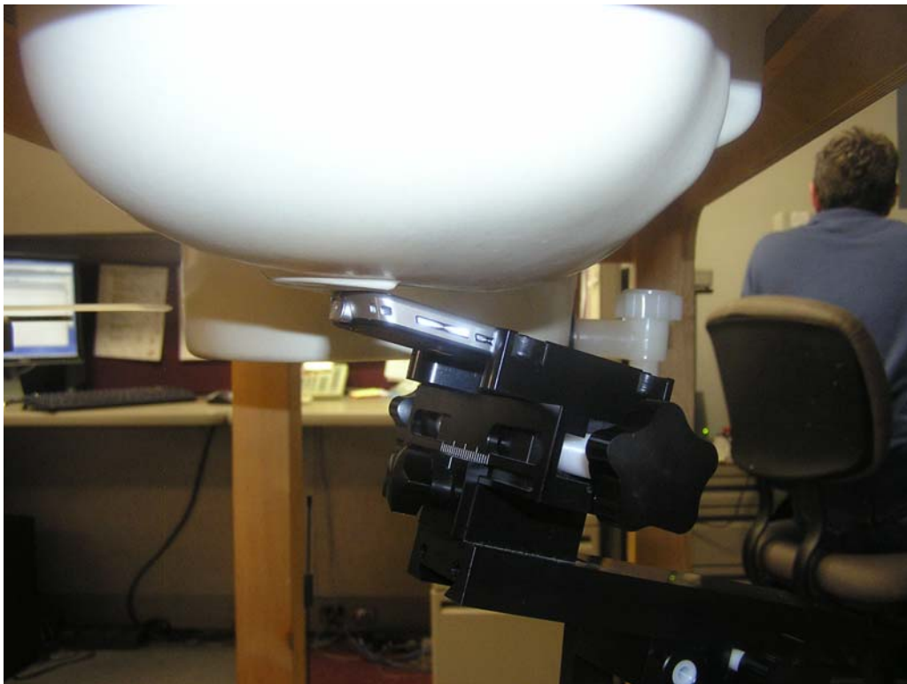
Figure 6 – Transceiver against head, 15° Tilt position