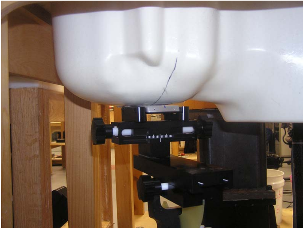
Figure 3 – Transceiver against head, Cheek Touch position