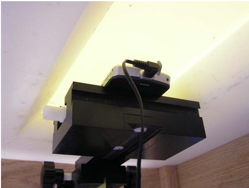
Figure 8 – Transceiver against body, Front of Phone 15 mm from Phantom position