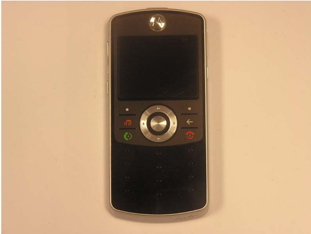
Figure 1 – Front of Transceiver