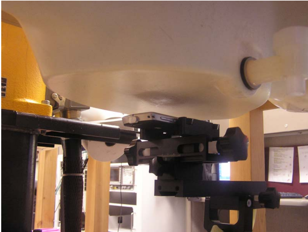
Figure 7 – Transceiver in Face Dispatch position, 25 mm from Phantom