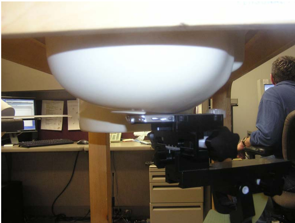
Figure 4 – Transceiver against head, Cheek Touch position