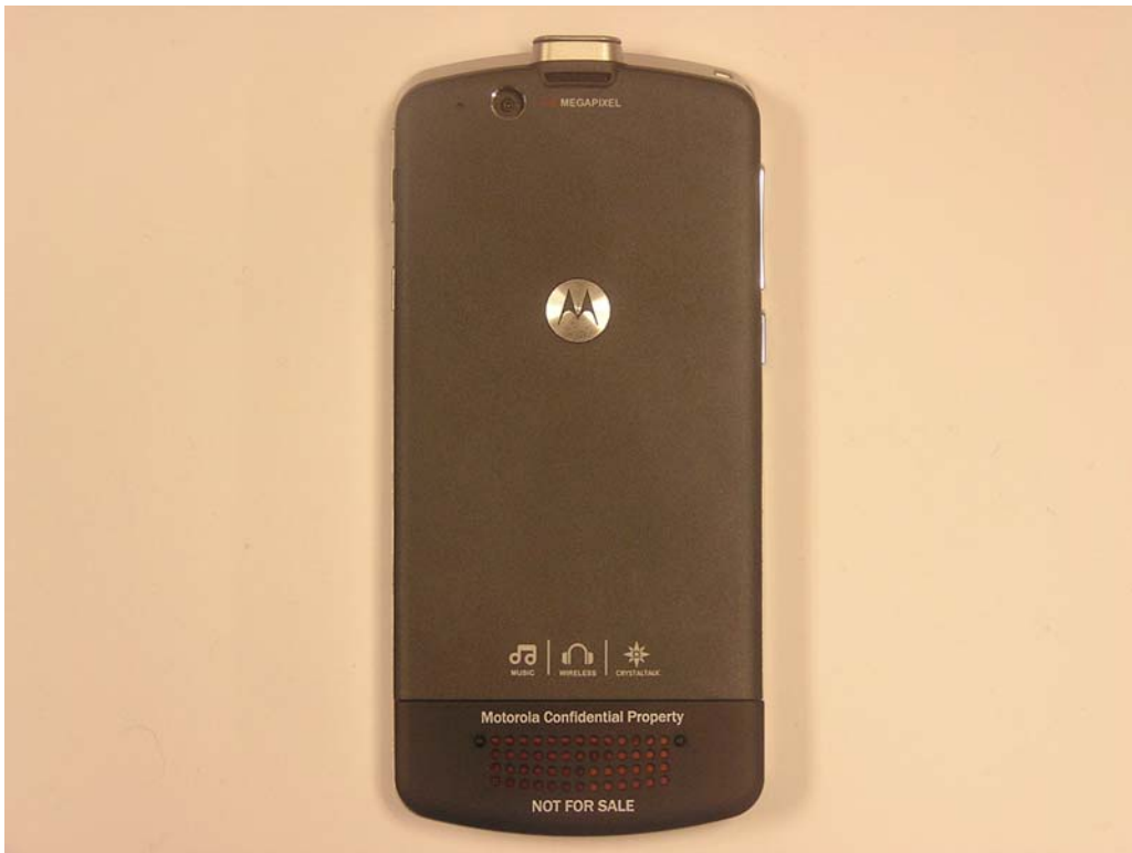
Figure 2 – Rear of Transceiver