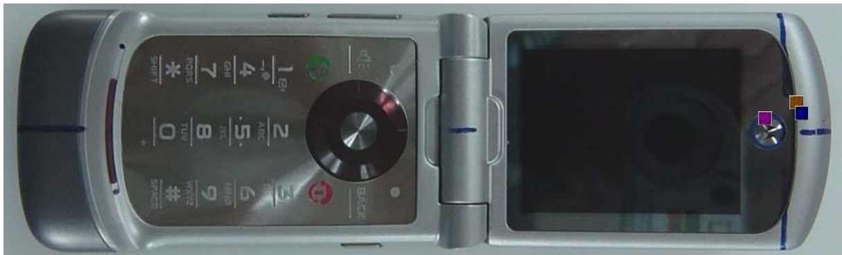
Figure A4-5. Location of Measured Points for T-coil measurements