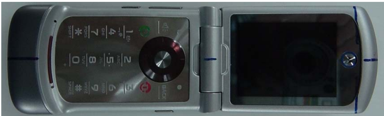
Figure A4-2. Phone Open