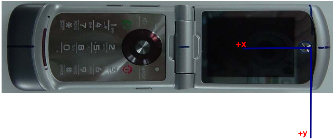
Figure A4-4. Coordinate Axis for T-coil Measurements