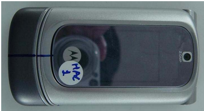
Figure A4-1. Phone Closed