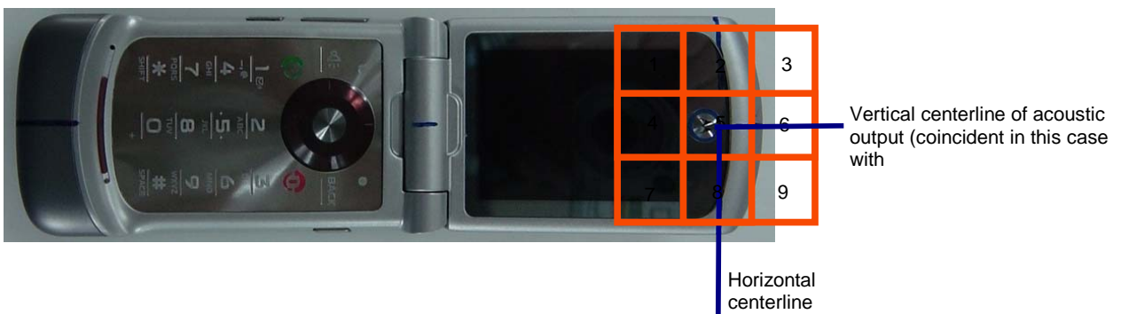
Figure A4-3. Phone Open - Orientation and Measurement Plane for RF Emissions Testing