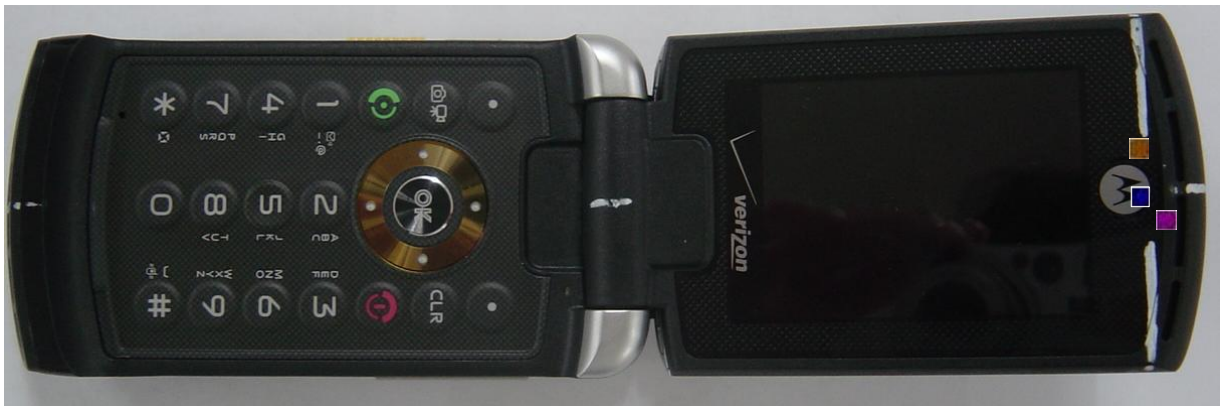
Figure A4-5. Location of Measured Points for T-coil measurements