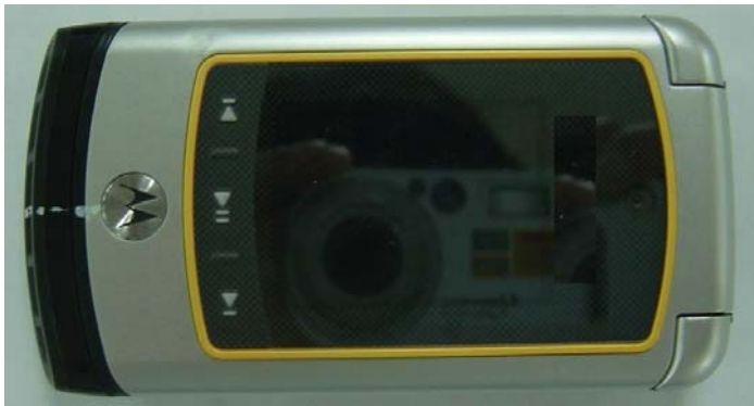
Figure A4-1. Phone Closed