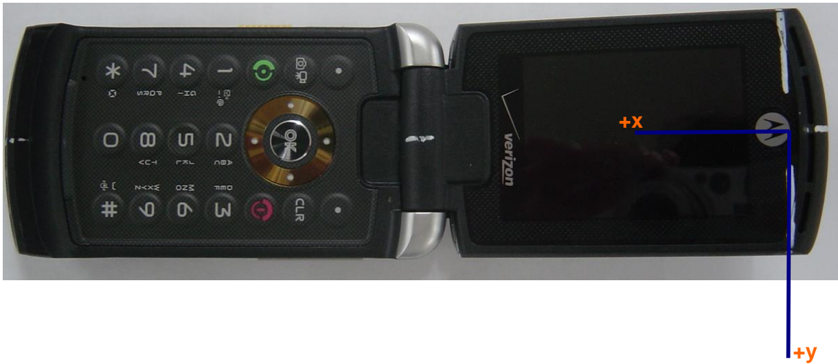
Figure A4-4. Coordinate Axis for T-coil Measurements